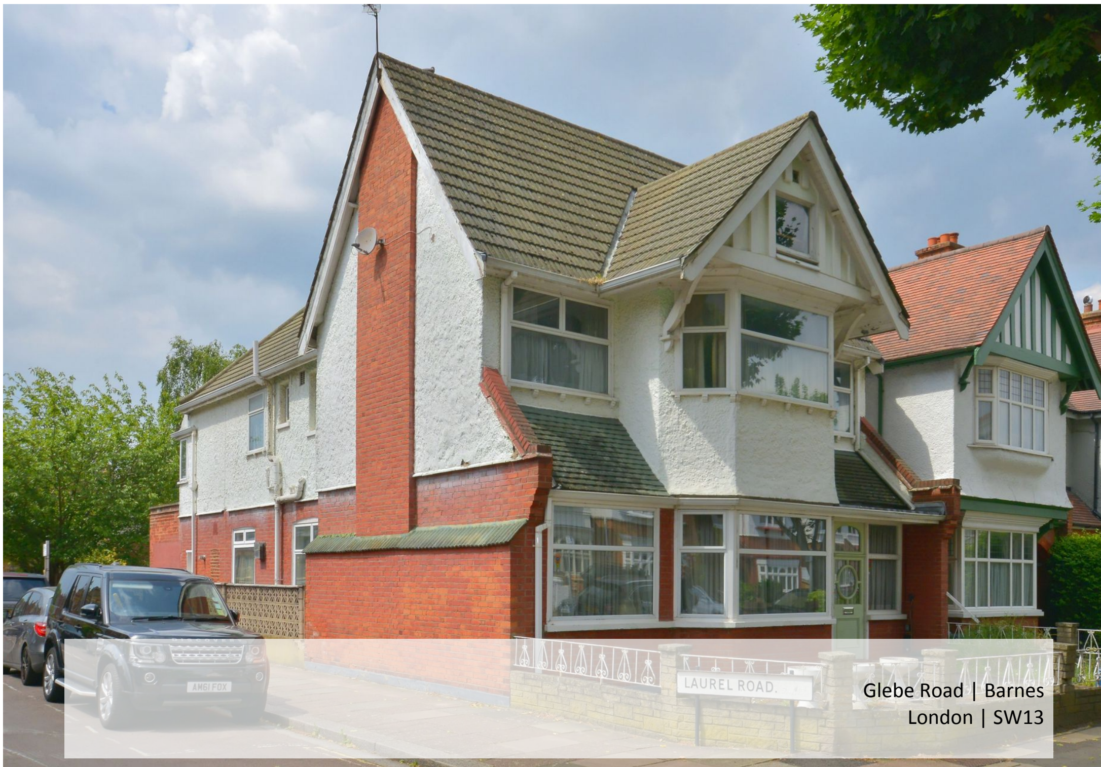
Glebe Road | Barnes London | SW13