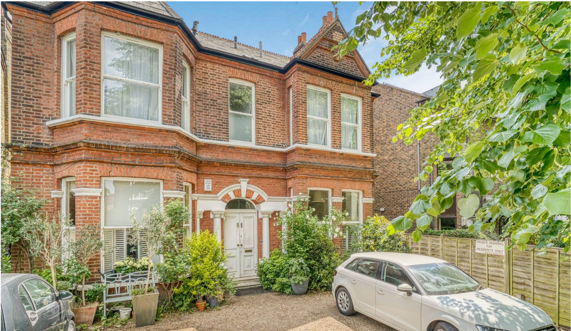
Castelnau, Barnes, London, SW13

Castelnau, Barnes, London, SW13 £500,000 Leasehold