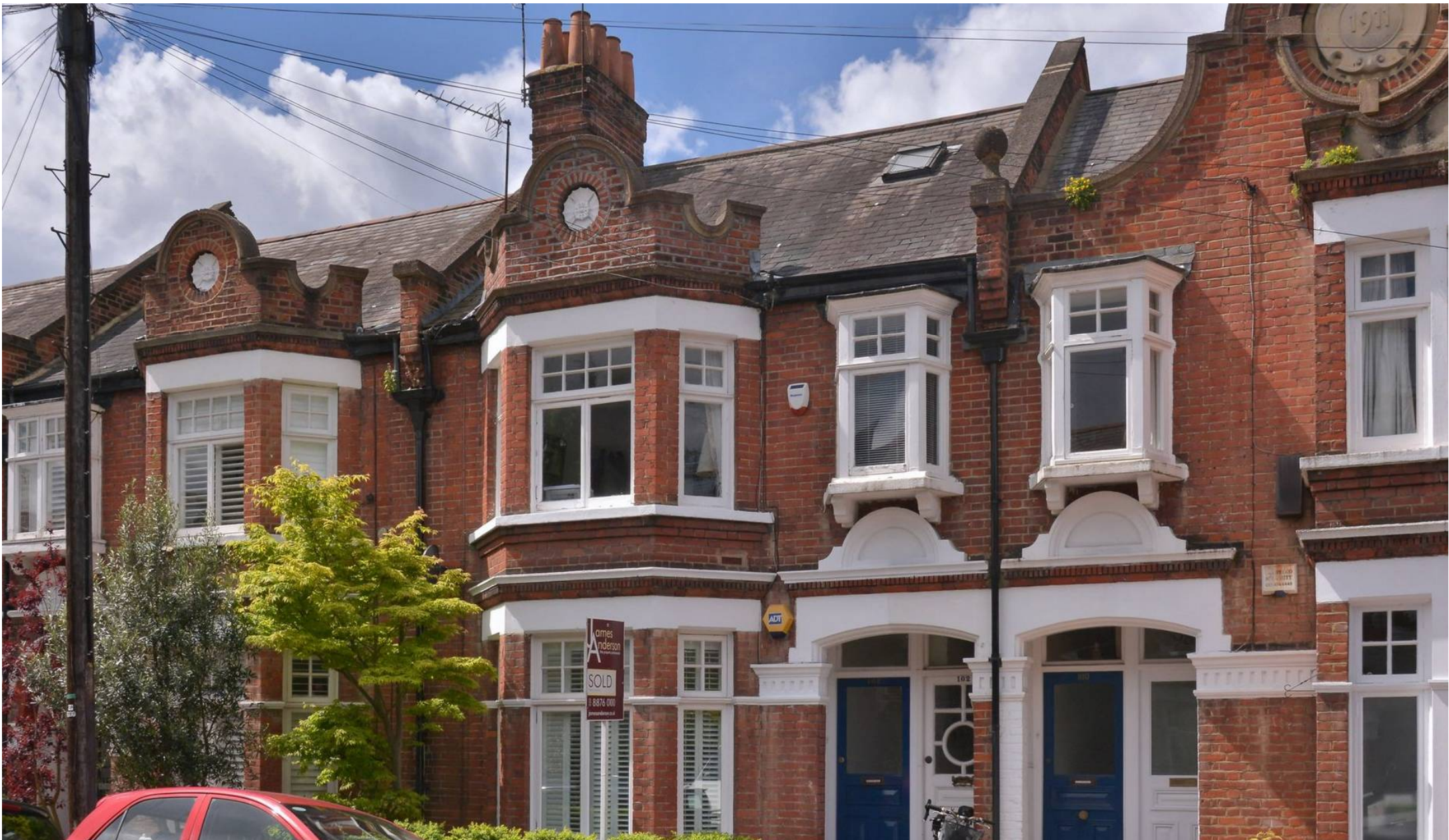
Cowley Road, Mortlake, London, SW14

Cowley Road, Mortlake, London, SW14 £599,950 Share of Freehold