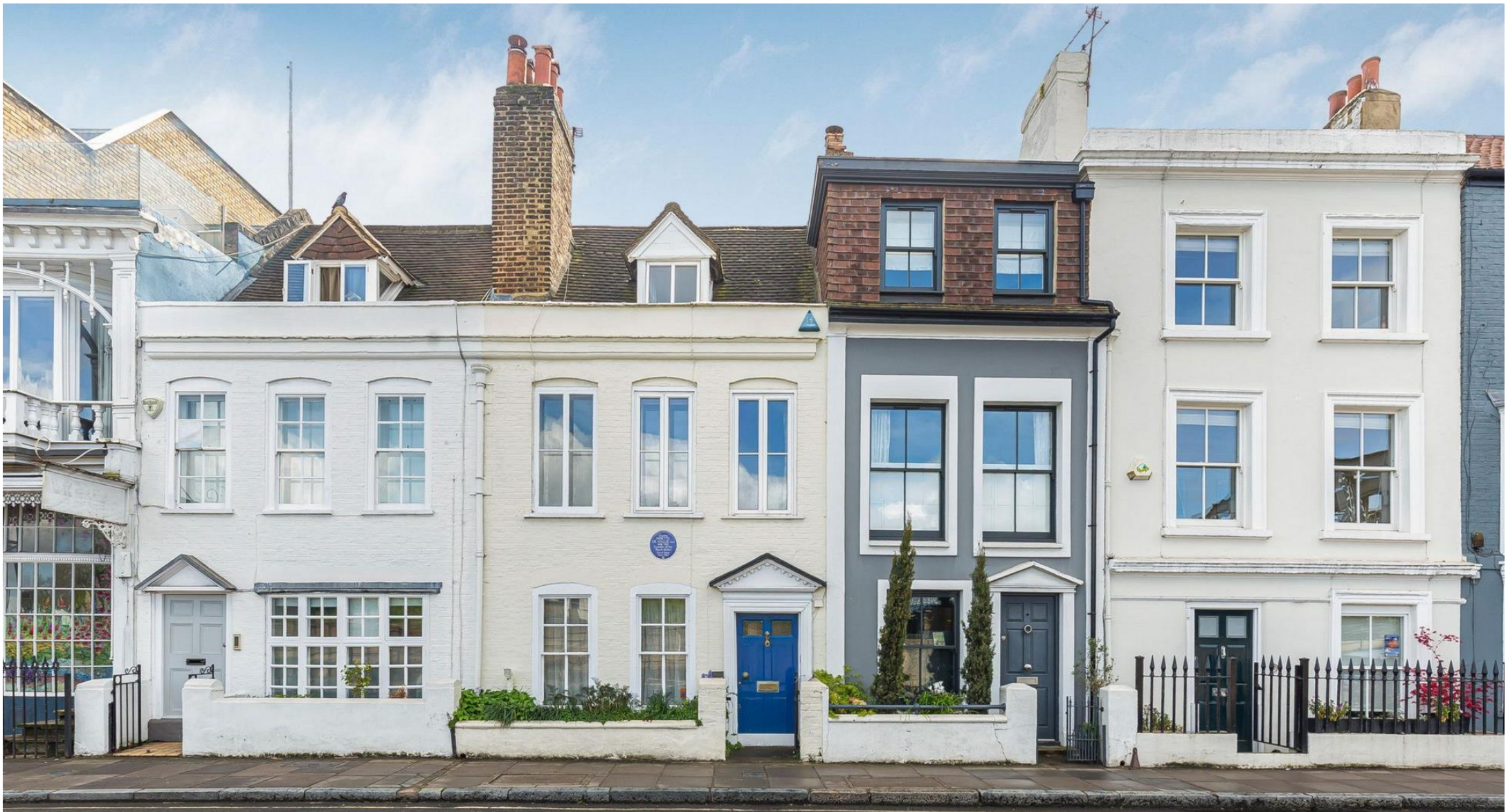
The Terrace | Barnes London | SW13