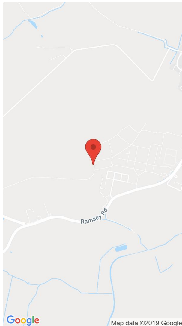
Google Map data ©2019 Google

Whilst every attempt has been made to ensure the accuracy of the floor plan contained here, measurements of doors, windows, rooms and any other items are approximate and no responsibility is taken for any error, omission, or mis-statement. This plan is for illustrative purposes only and should be used as such by any prospective purchaser. The services, systems and appliances shown have not been tested and no guarantee as to their operability or efficiency can be given. Made with Metropix ©2008