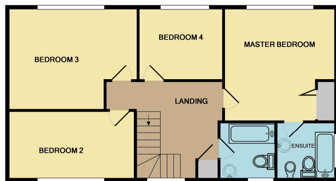
1ST FLOOR APPROX. FLOOR AREA 70.3 SQ.M. (757 SQ.FT.)