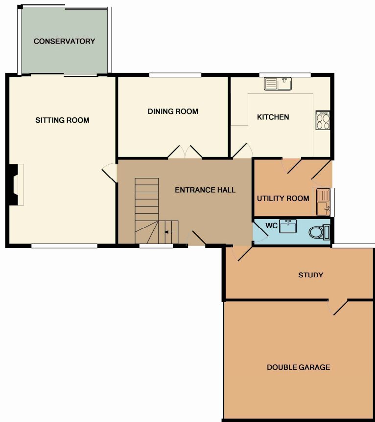
GROUND FLOOR APPROX. FLOOR AREA 111.6 SQ.M. (1201 SQ.FT.)