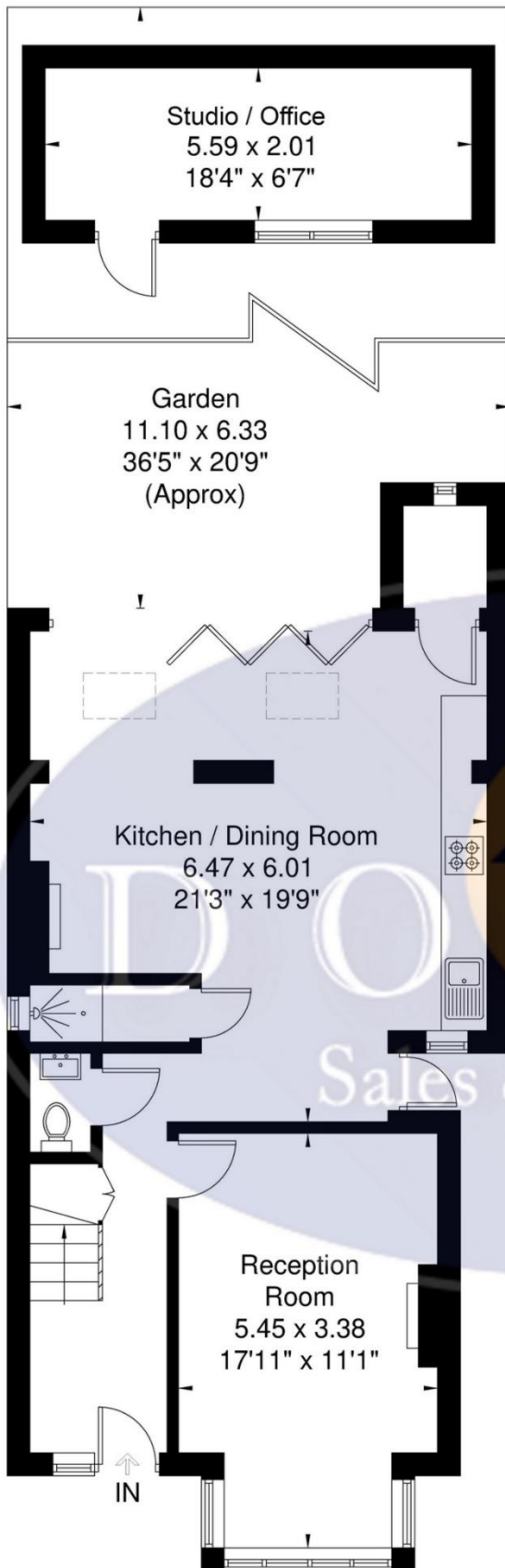
Ground Floor 64.9 sq m / 698 sq ft