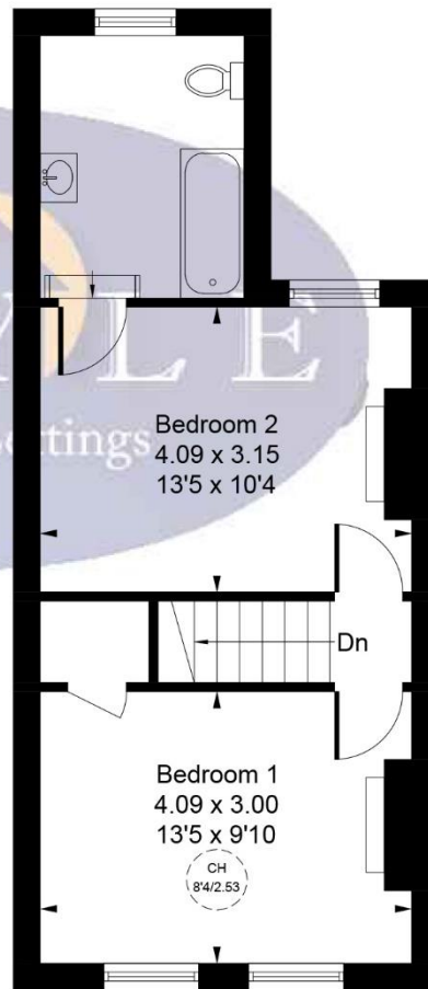
First Floor 35.05 sq m / 377 sq ft

Whilst every attempt has been made to ensure the accuracy of the floor plan contained here, measurements of doors, windows, rooms and any other items are approximate and no responsibility is taken for any error, omission, or mis-statement. This plan is for illustrative purposes only and should be used as such by any prospective purchaser.