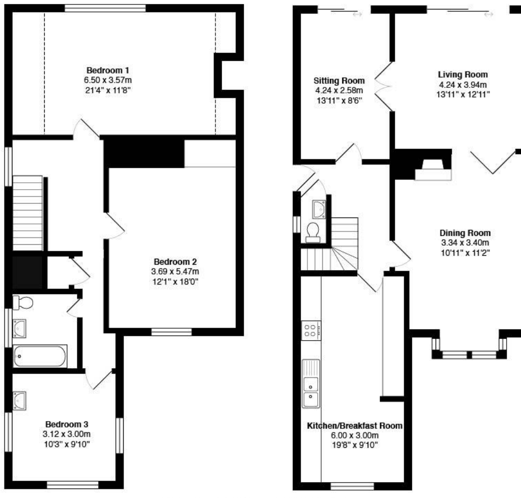
All measurements are approximate and for display purposes only

Total Area: 145.8 m<sup>2</sup> ... 1569 ft<sup>2</sup>