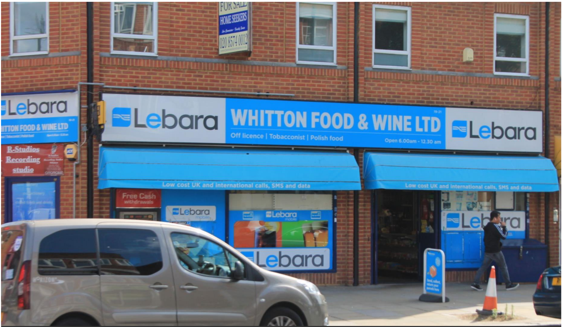
High Street, Whitton, Twickenham, TW2

High Street, Whitton, Twickenham, TW2 Asking price of £25,000 Leasehold