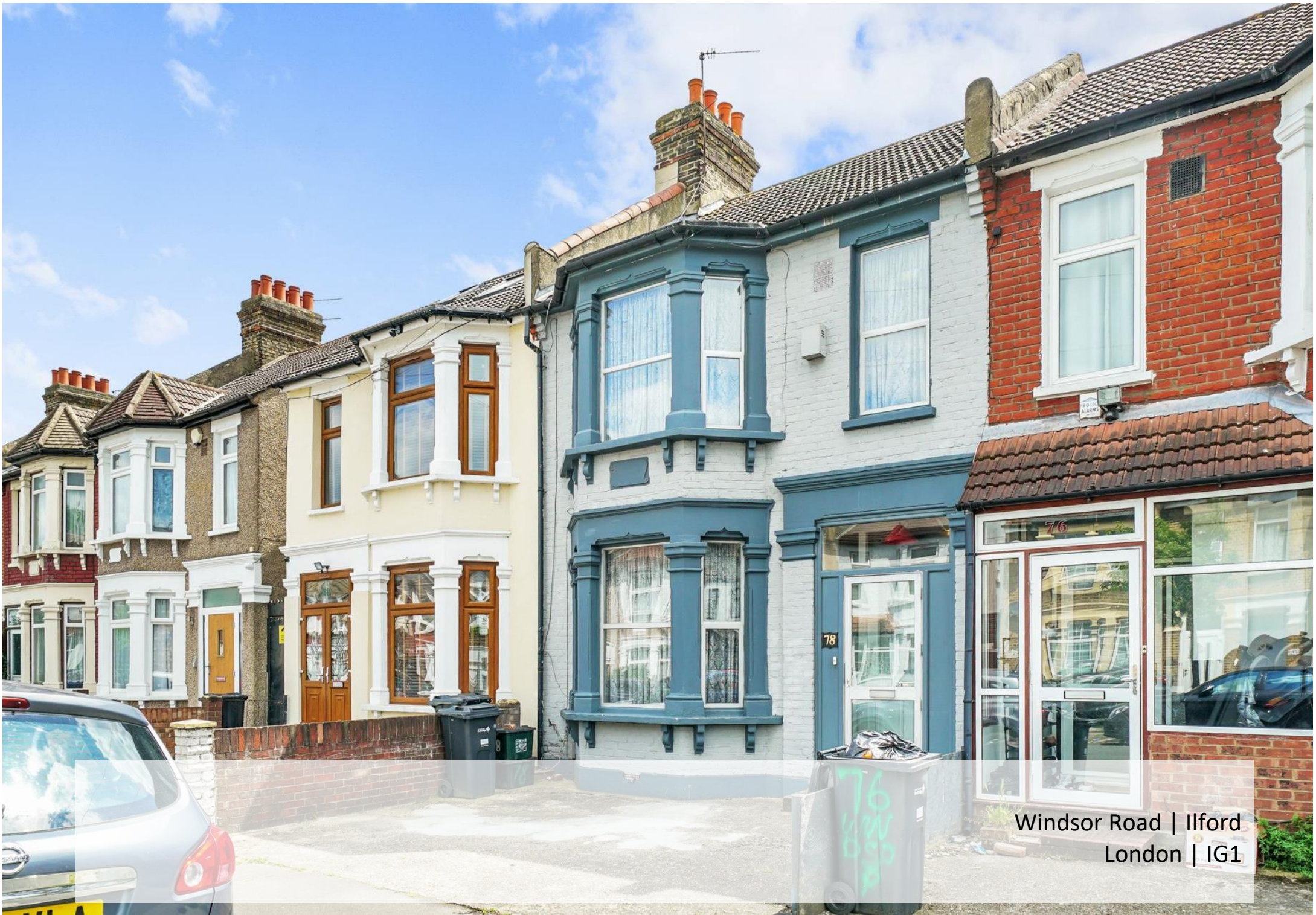
Windsor Road | Ilford London | IG1