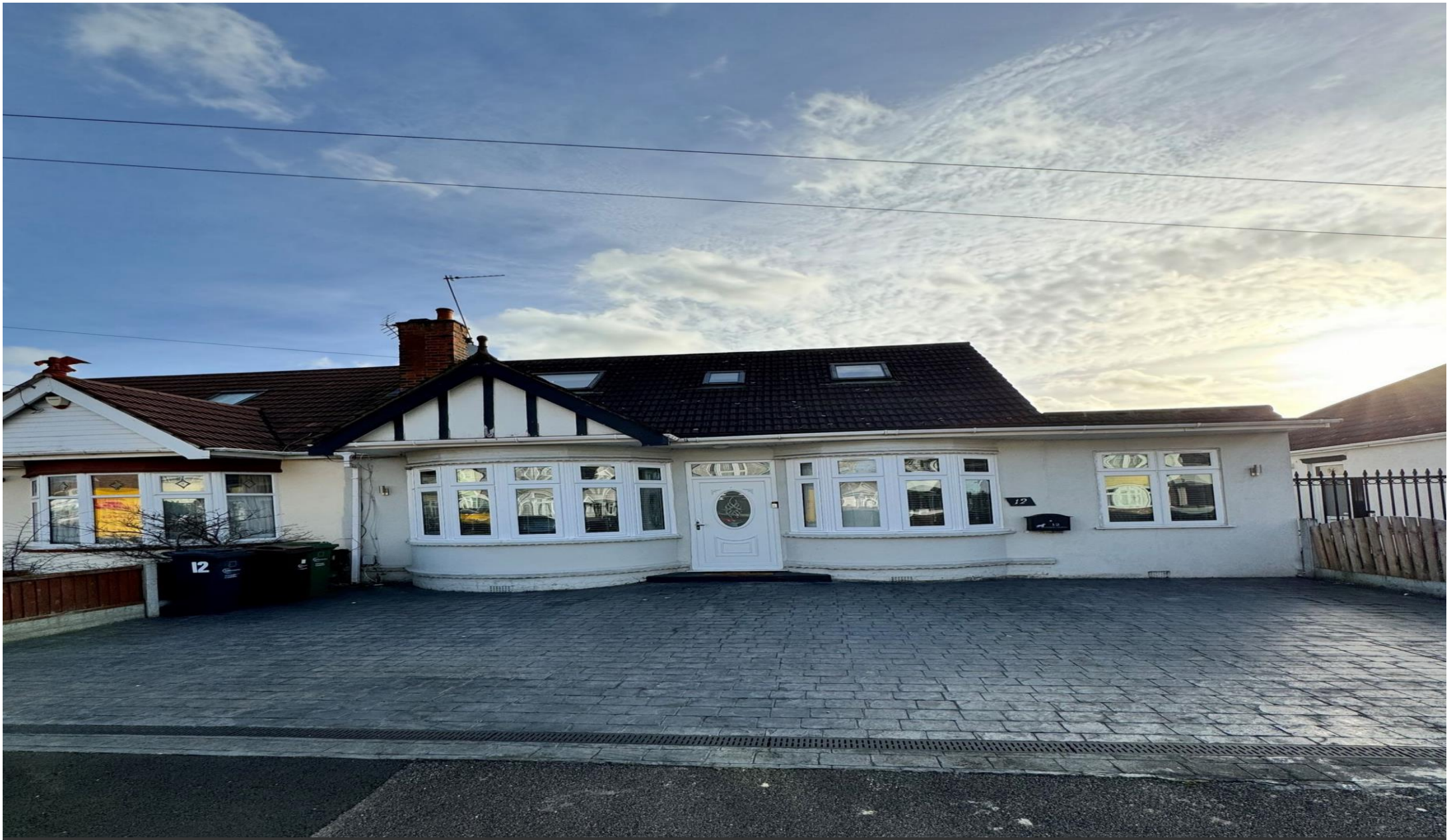
Adelaide Gardens, Chadwell Heath, RM6

Adelaide Gardens, Chadwell Heath, RM6 Asking price of £650,000 Freehold