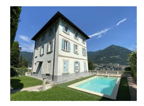
Beautiful Villa with swimming pool and garden in Torno