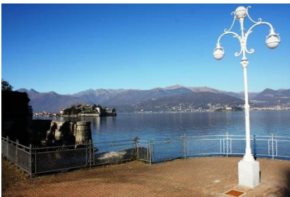
2 bedroom apartment in Lake Maggiore, stresa