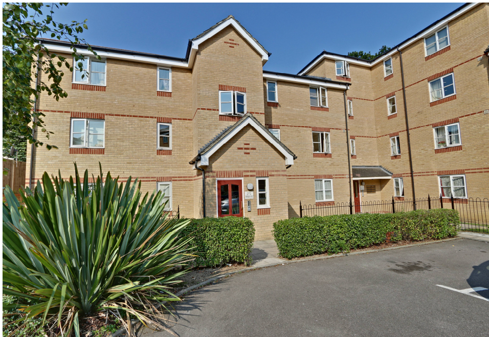
Pickard Close, Southgate, N14