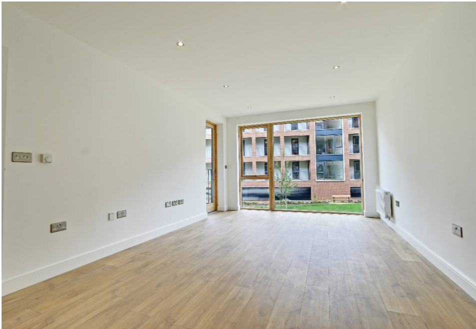
Ebony Crescent, Cockfosters, EN4