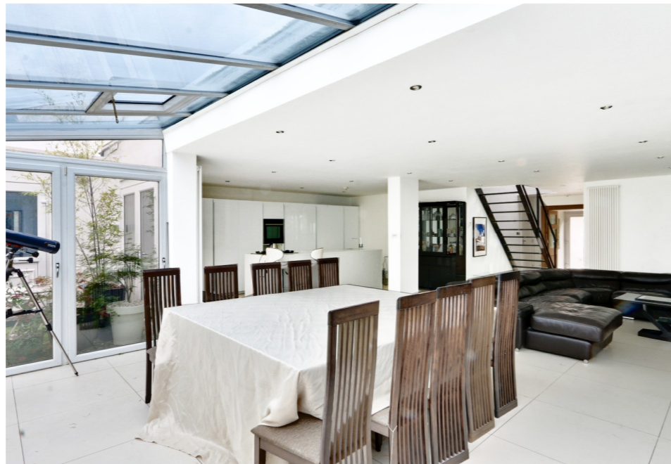
Covert Way, Hadley Wood, EN4