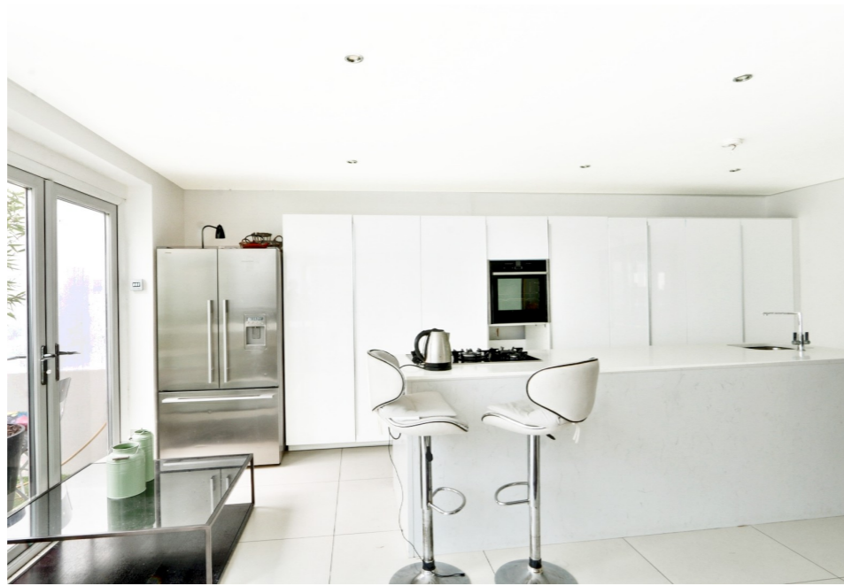
Covert Way, Hadley Wood, EN4