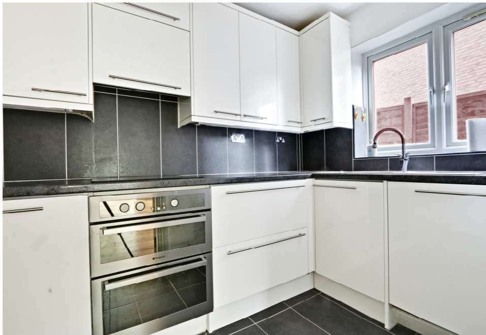
Park Road, New Barnet, EN4