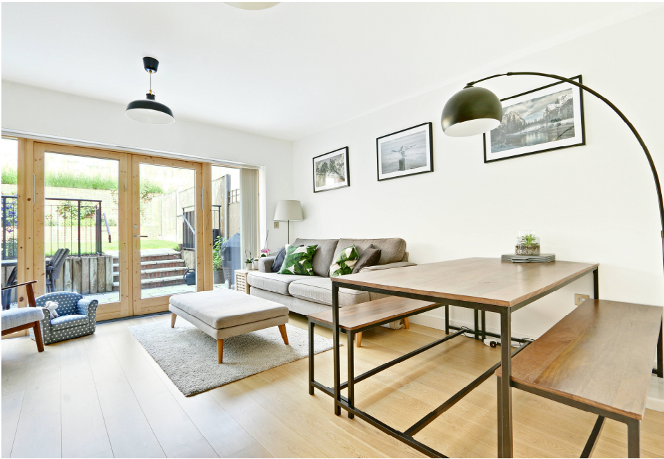
Cornell Gardens, Bolingbroke Park, Cockfosters, EN4