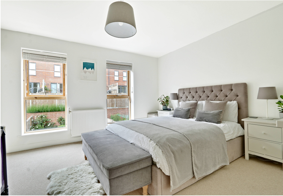
Cornell Gardens, Bolingbroke Park, Cockfosters, EN4