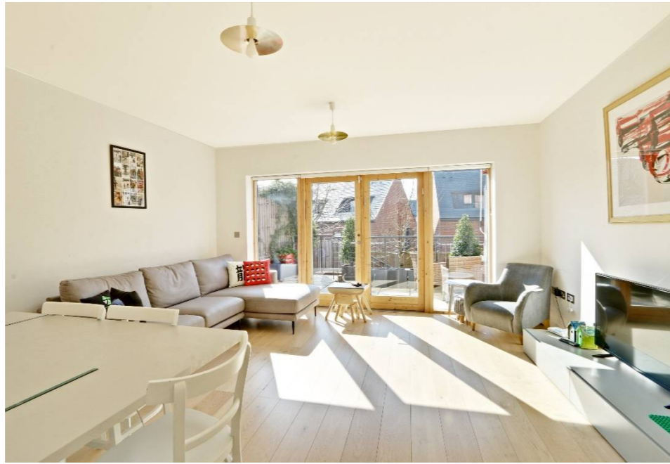
Ebony Crescent, Cockfosters, EN4