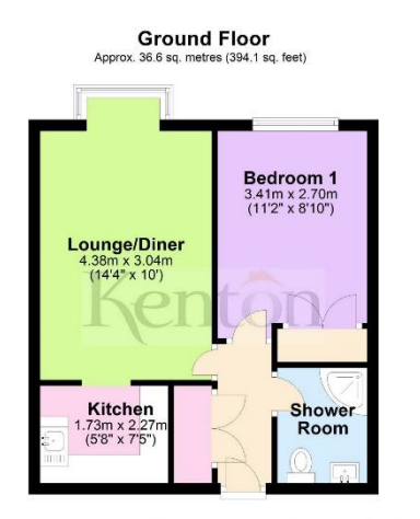
Total area: approx. 36.6 sq. metres (394.1 sq. feet)