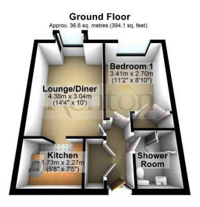
Total area: approx. 36.6 sq. metres (394.1 sq. feet)