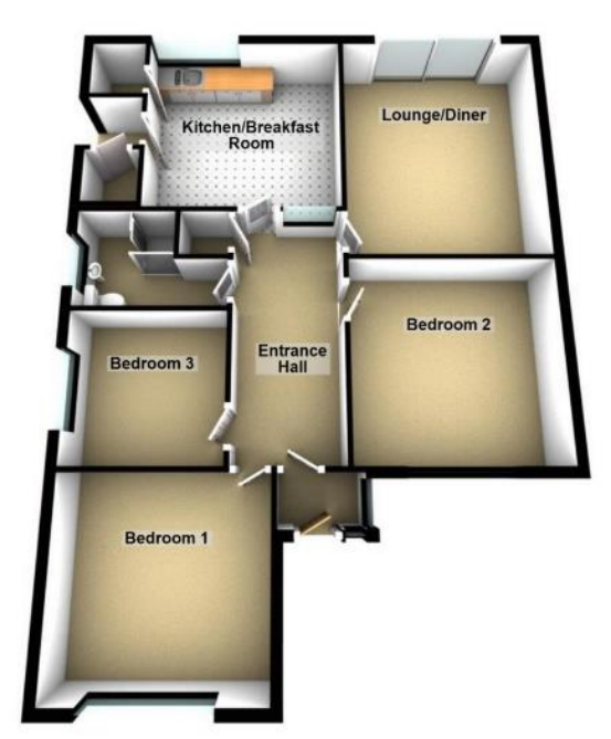
Total area: approx. 98.7 sq. metres (1062.2 sq. feet)