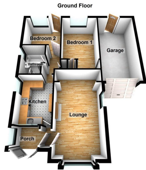
Total area: approx. 68.3 sq. metres (735.1 sq. feet)