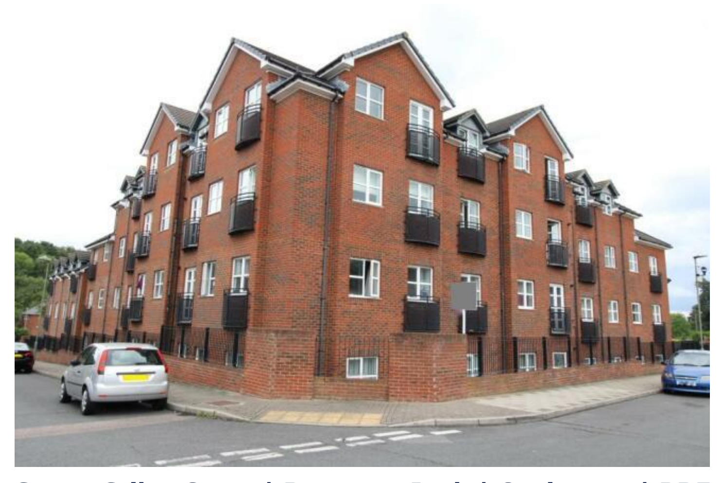
Seven Stiles Court | Ranmore Path | Orpington | BR5 £130,000