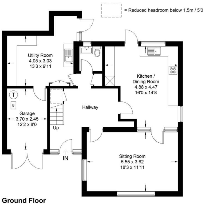
Illustration for identification purposes only, measurements are approximate, not to scale. (ID1069186)