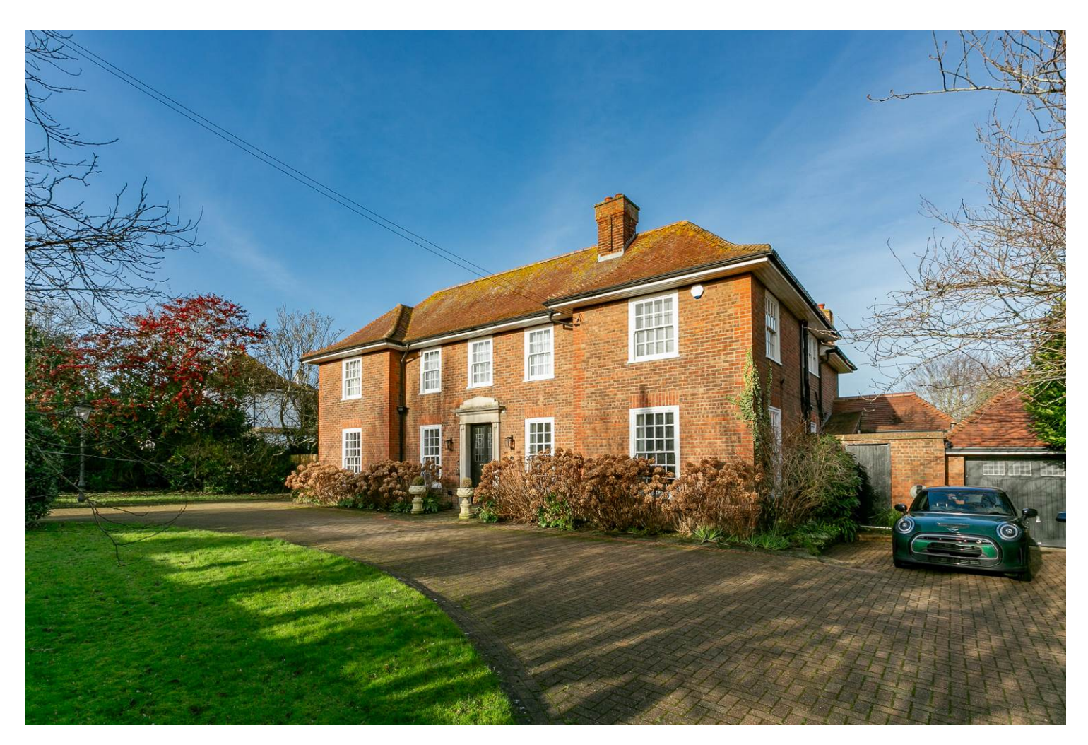
THE BLOSSOMS, 6 JOINTON ROAD, FOLKESTONE

This handsome double fronted detached house occupies a generous plot of approximately 0.5 of an acre in a prime location, moments from mainline stations. The property has benefitted from an extensive refurbishment and now offers circa 3200 sq ft of impeccably presented accommodation. EPC D.