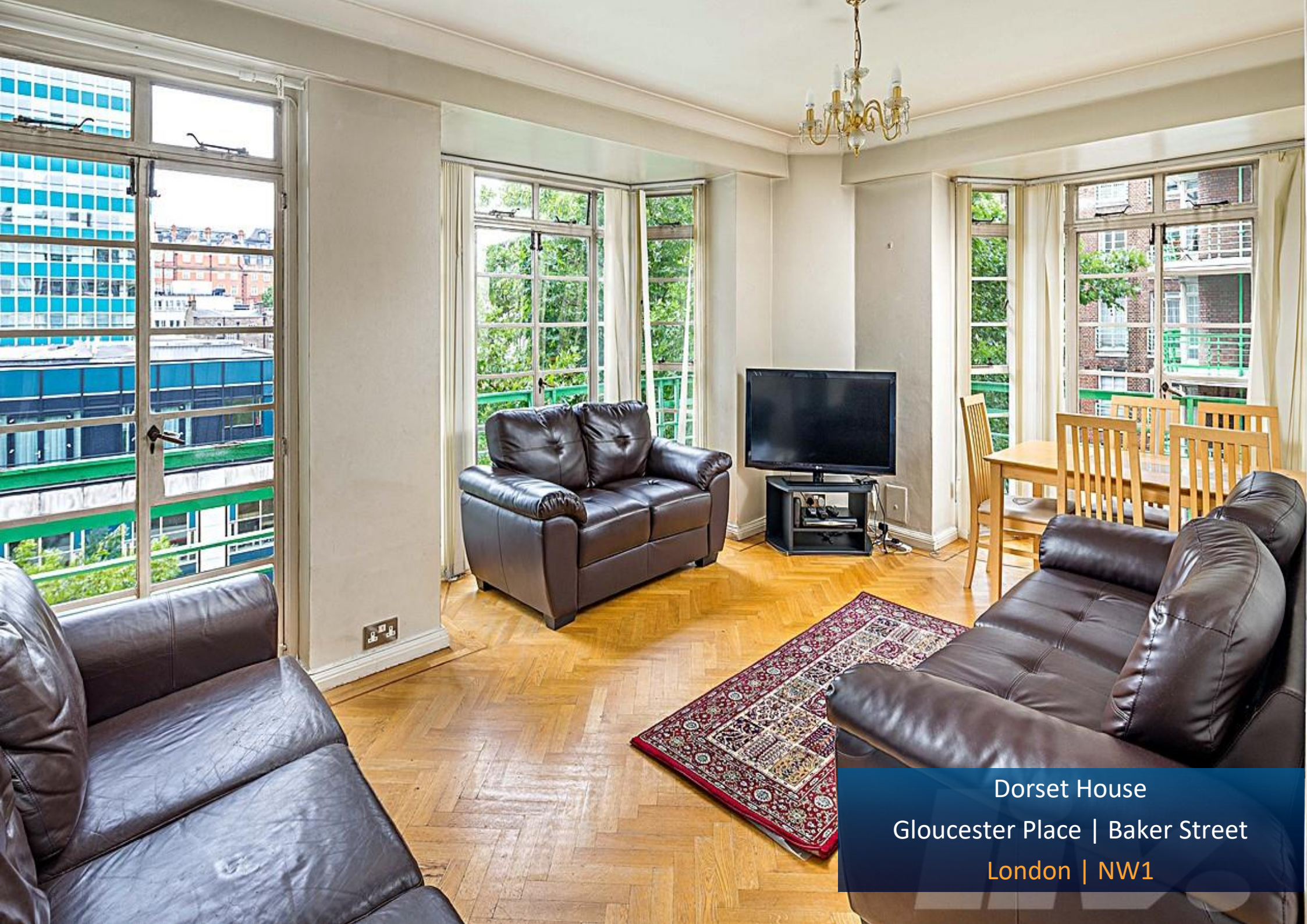
Dorset House Gloucester Place | Baker Street London | NW1