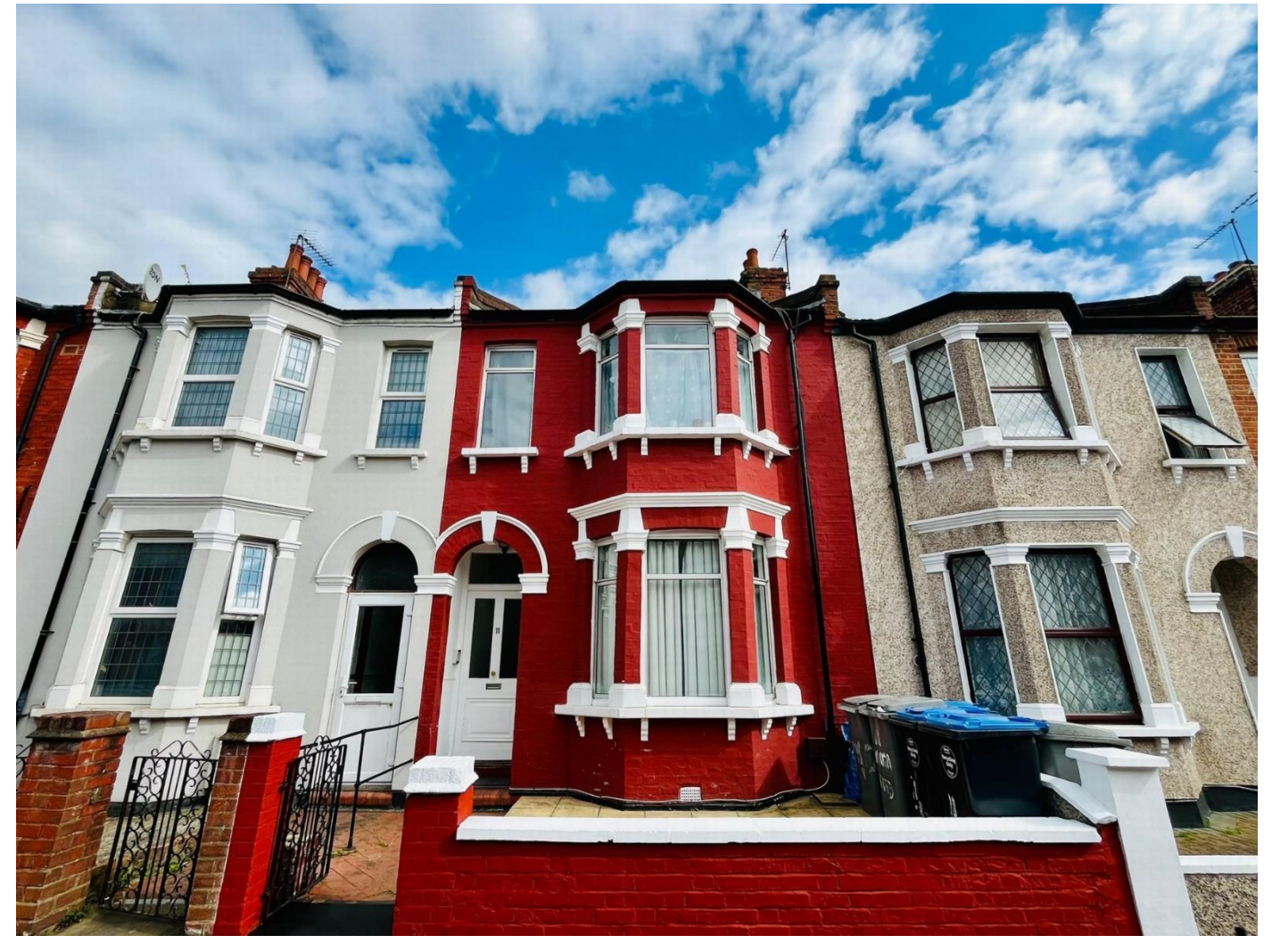
Mora Road, Cricklewood, NW2