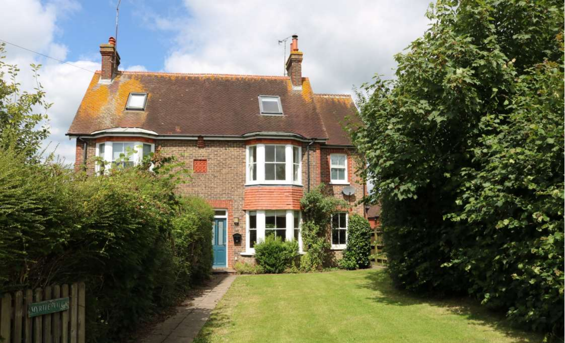
Myrtle Villa Chapel Lane, Horsted Keynes, West Sussex, RH17 7AF