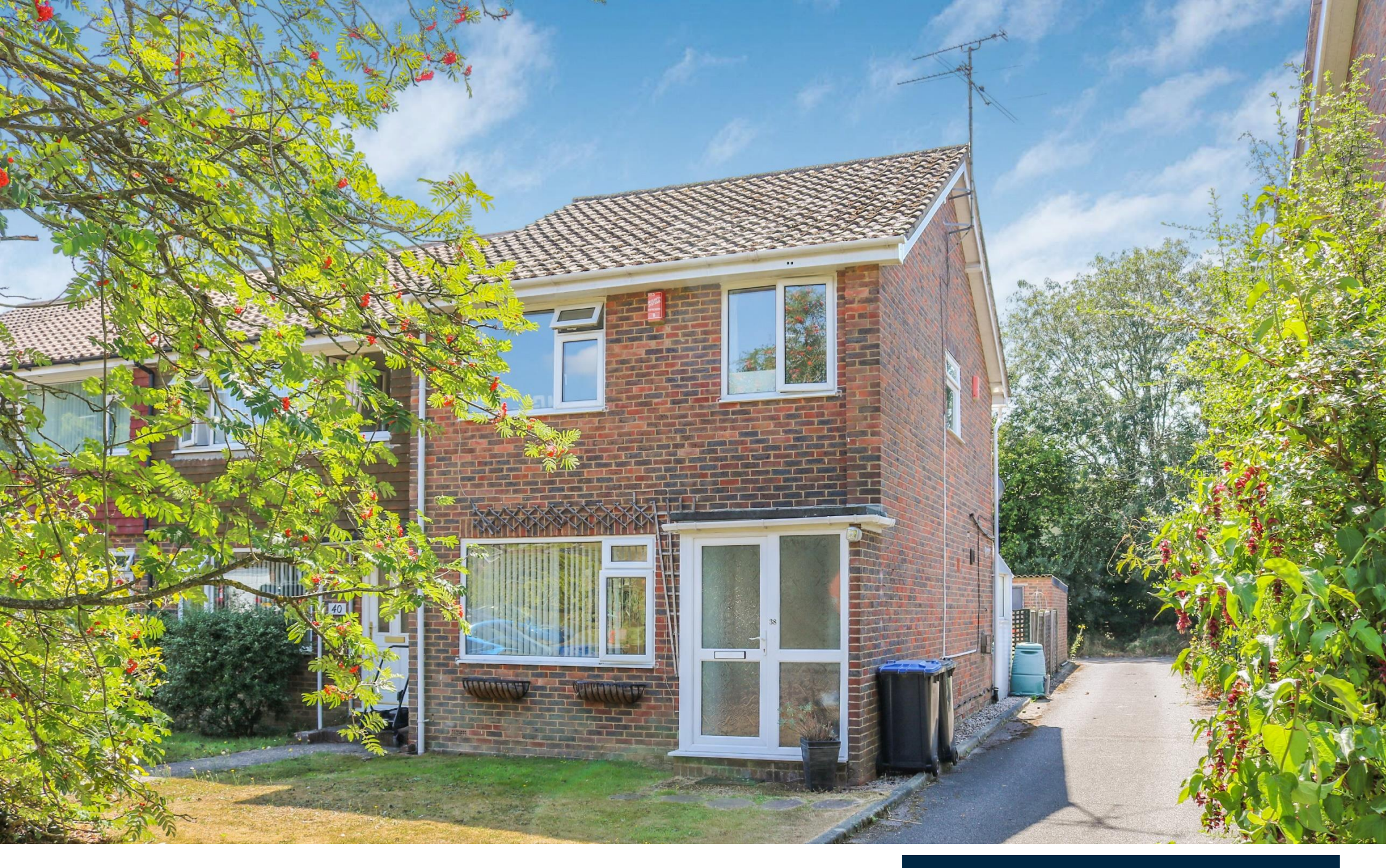
By Sunte Lindfield, West Sussex, RH16 2