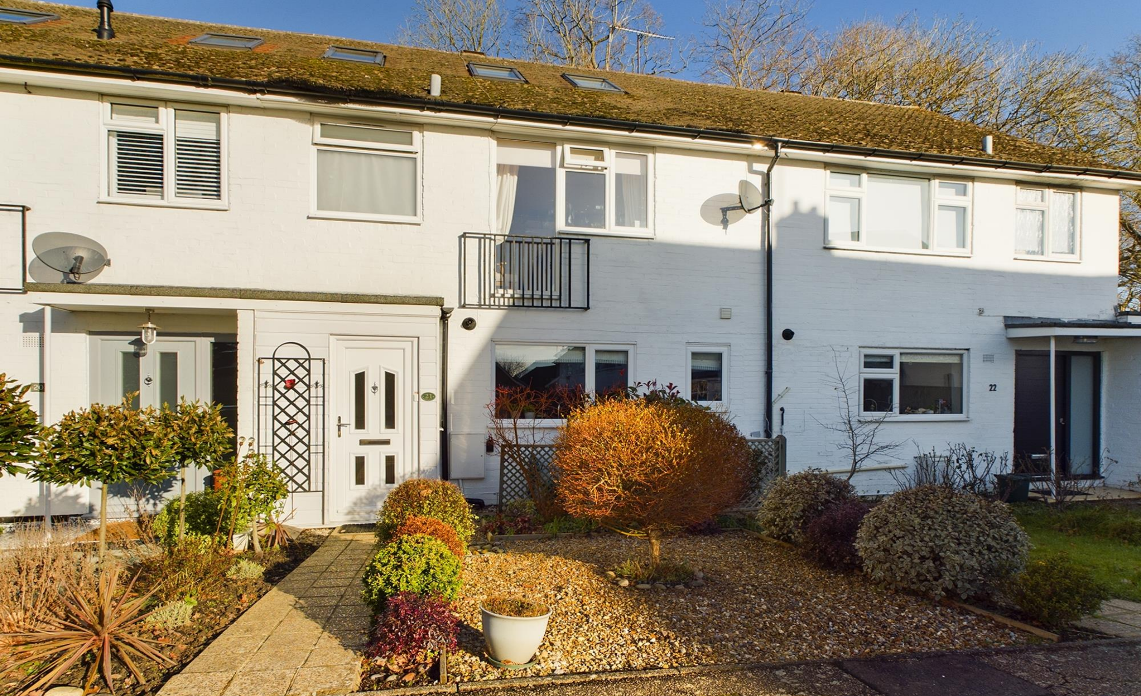
Finches Gardens Lindfield, West Sussex, RH16 2