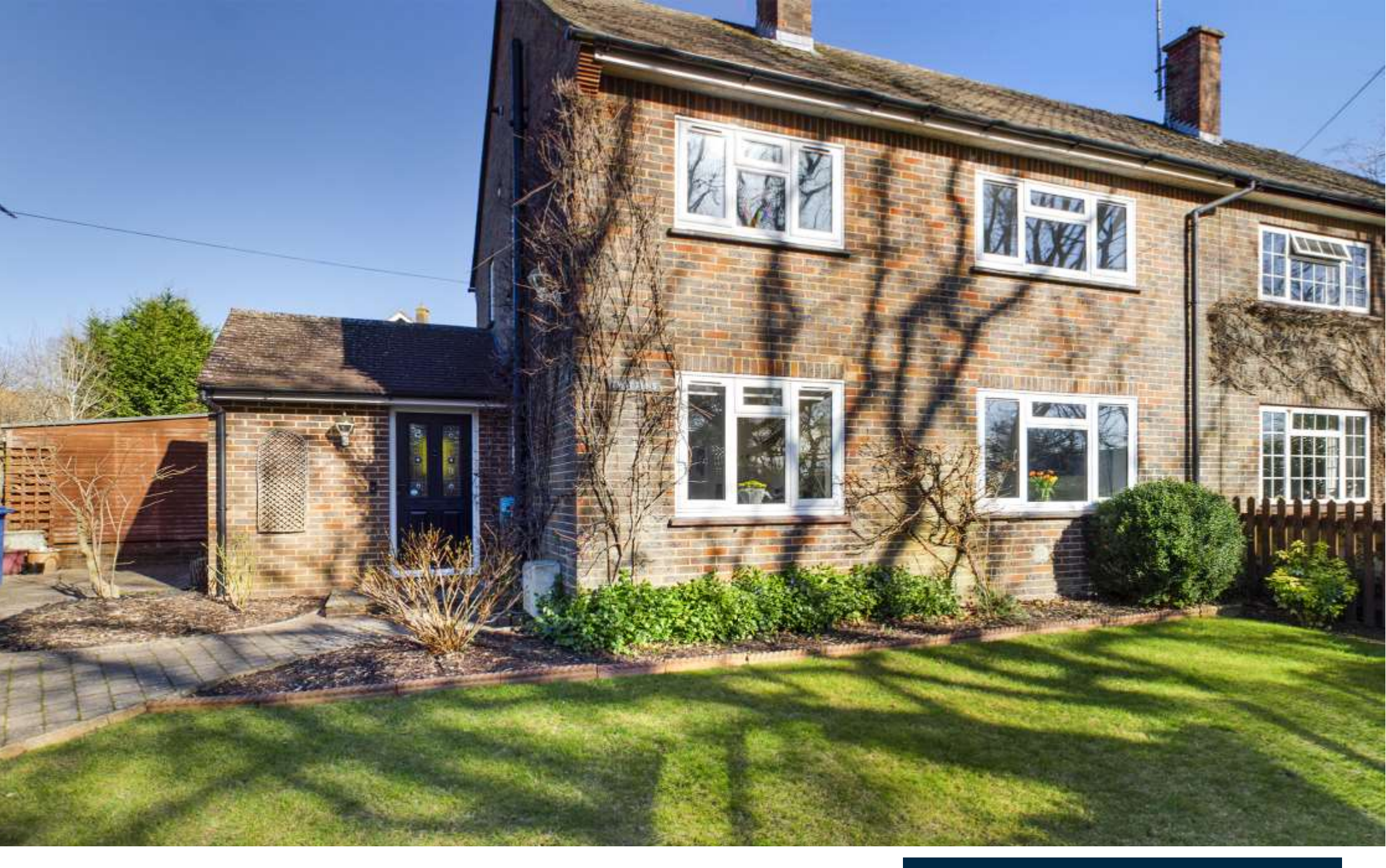
Twittens Street Lane, Ardingly, West Sussex, RH17 6UF