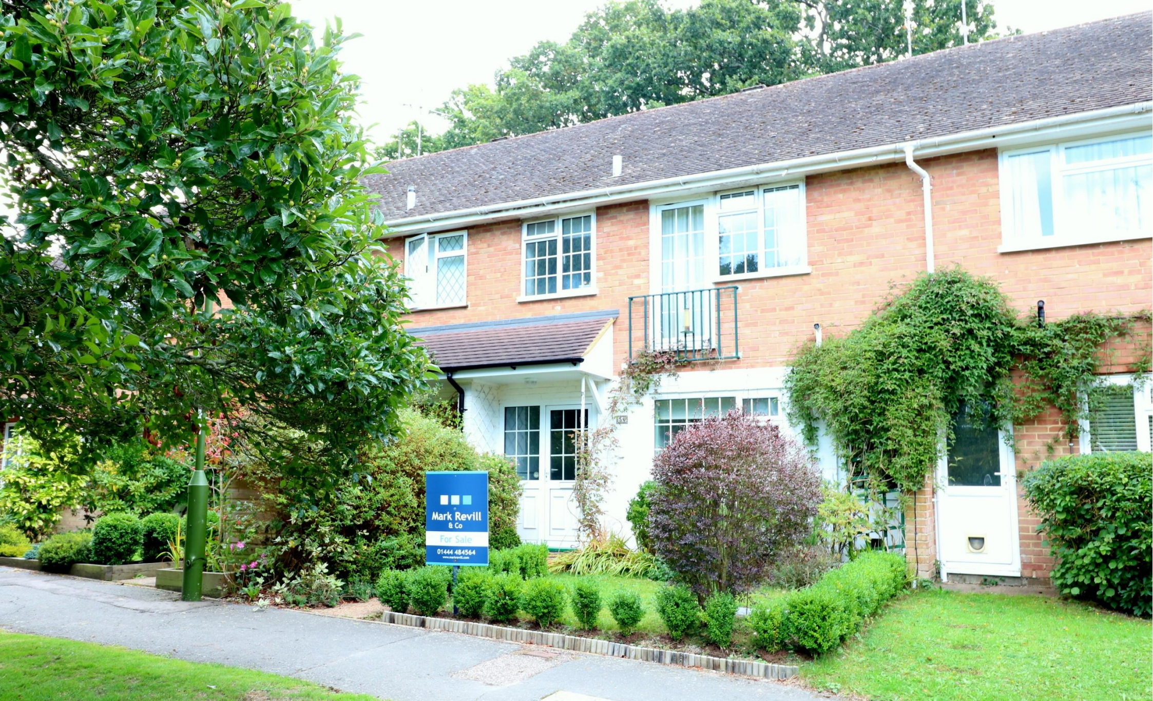
Finches Gardens Lindfield, West Sussex, RH16 2PB