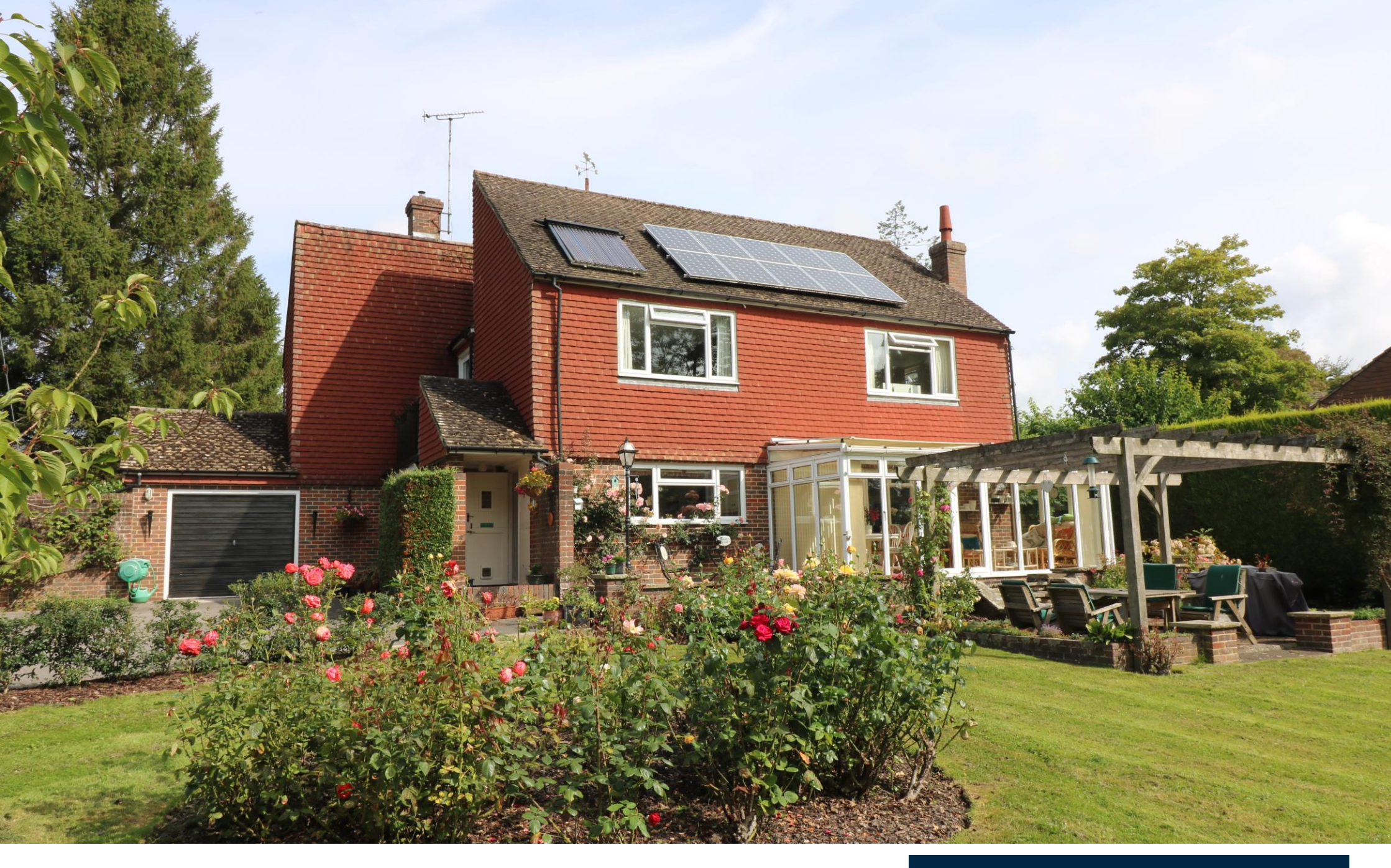
Wyatts Lane, Horsted Keynes, West Sussex, RH17 7AH