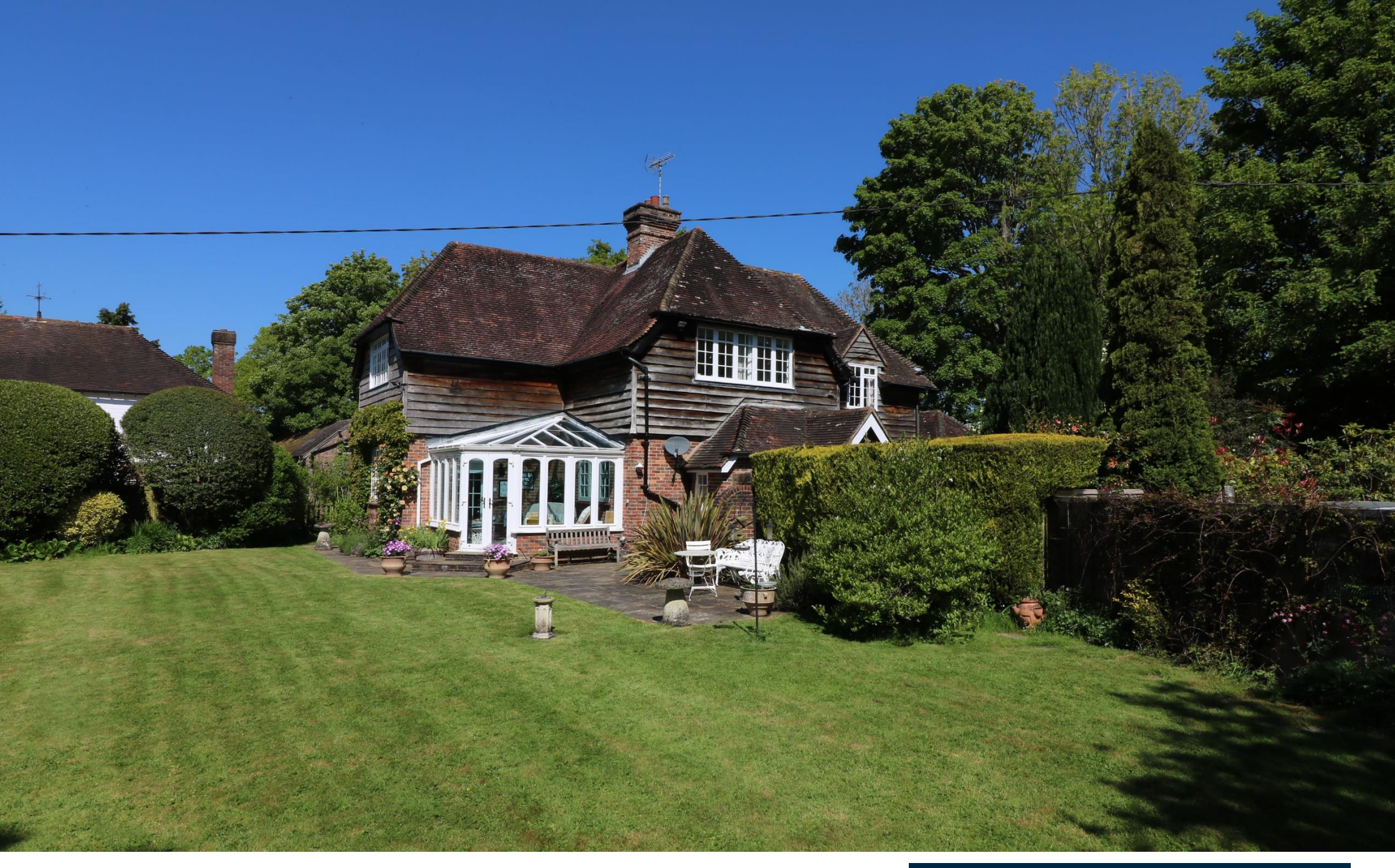
The Cottage Nether Walstead, East Mascalls Lane, Lindfield, RH16 2QJ