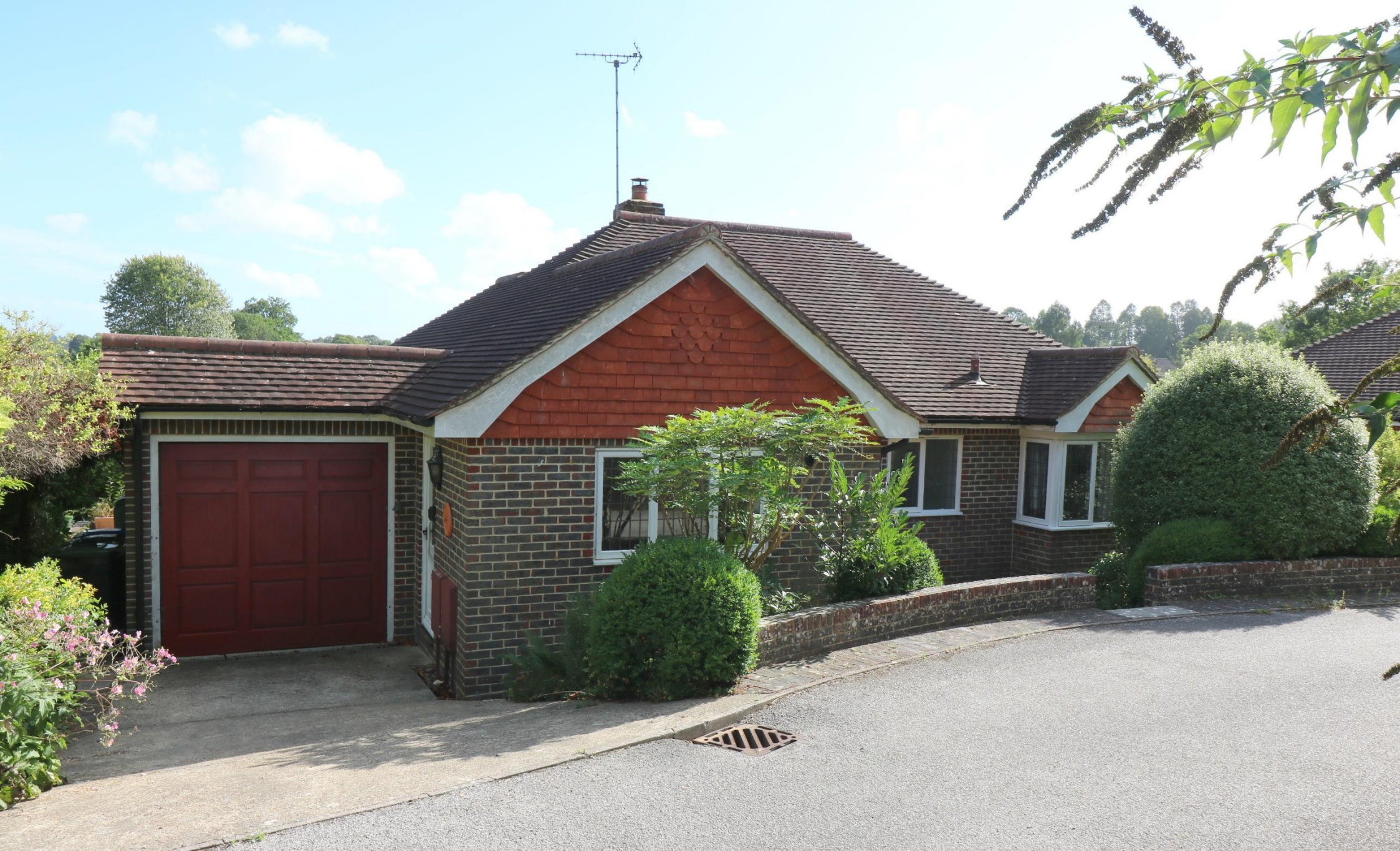
6 Barrington Wood Lindfield, West Sussex, RH16 2