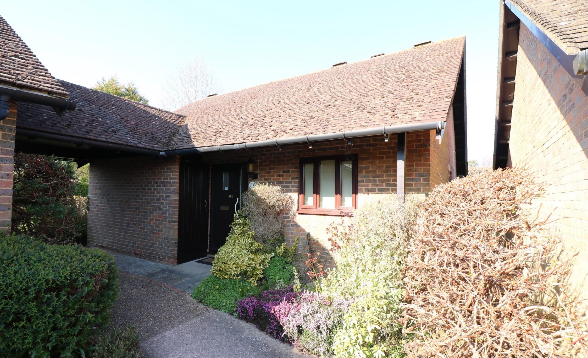
Harvest Close Lindfield, West Sussex, RH16 2