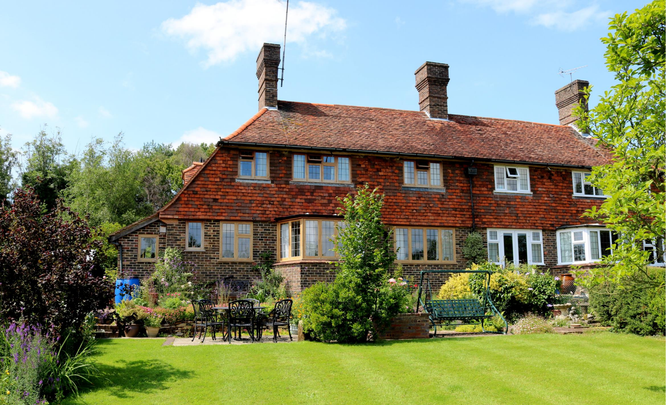
2 Stoaches Cottages Freshfield Lane, Danehill, East Sussex. RH17 7HQ