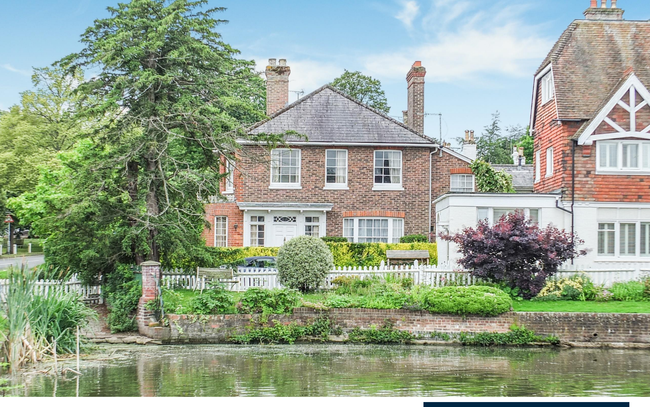
High Street Lindfield, West Sussex, RH16