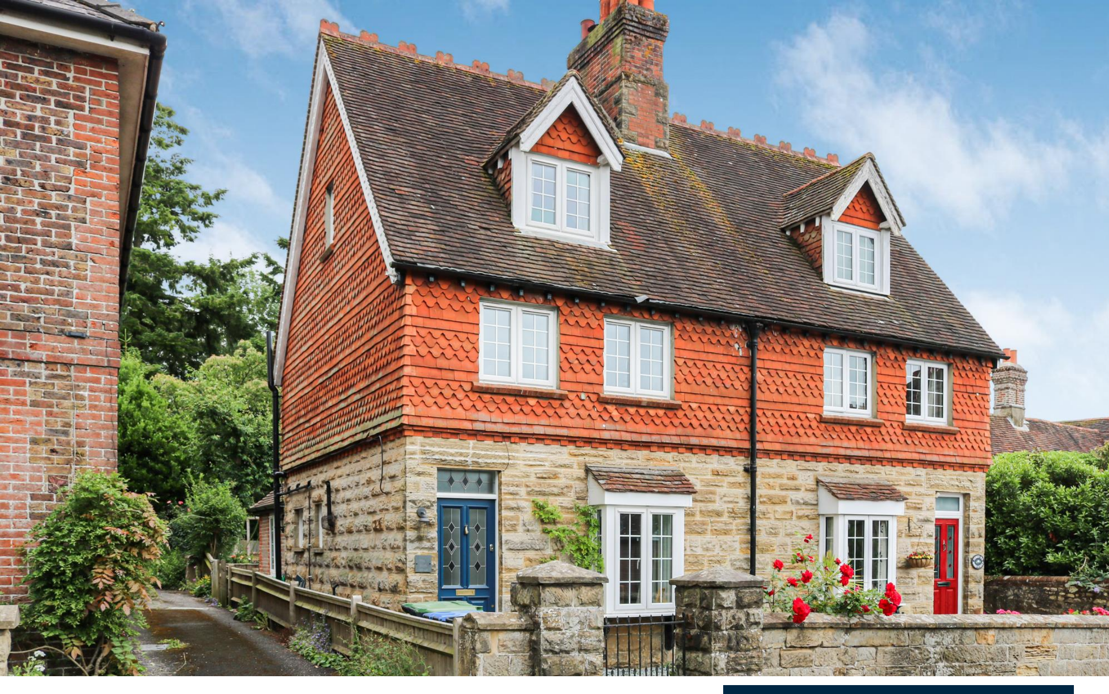
High Street Ardingly, West Sussex, RH17 6