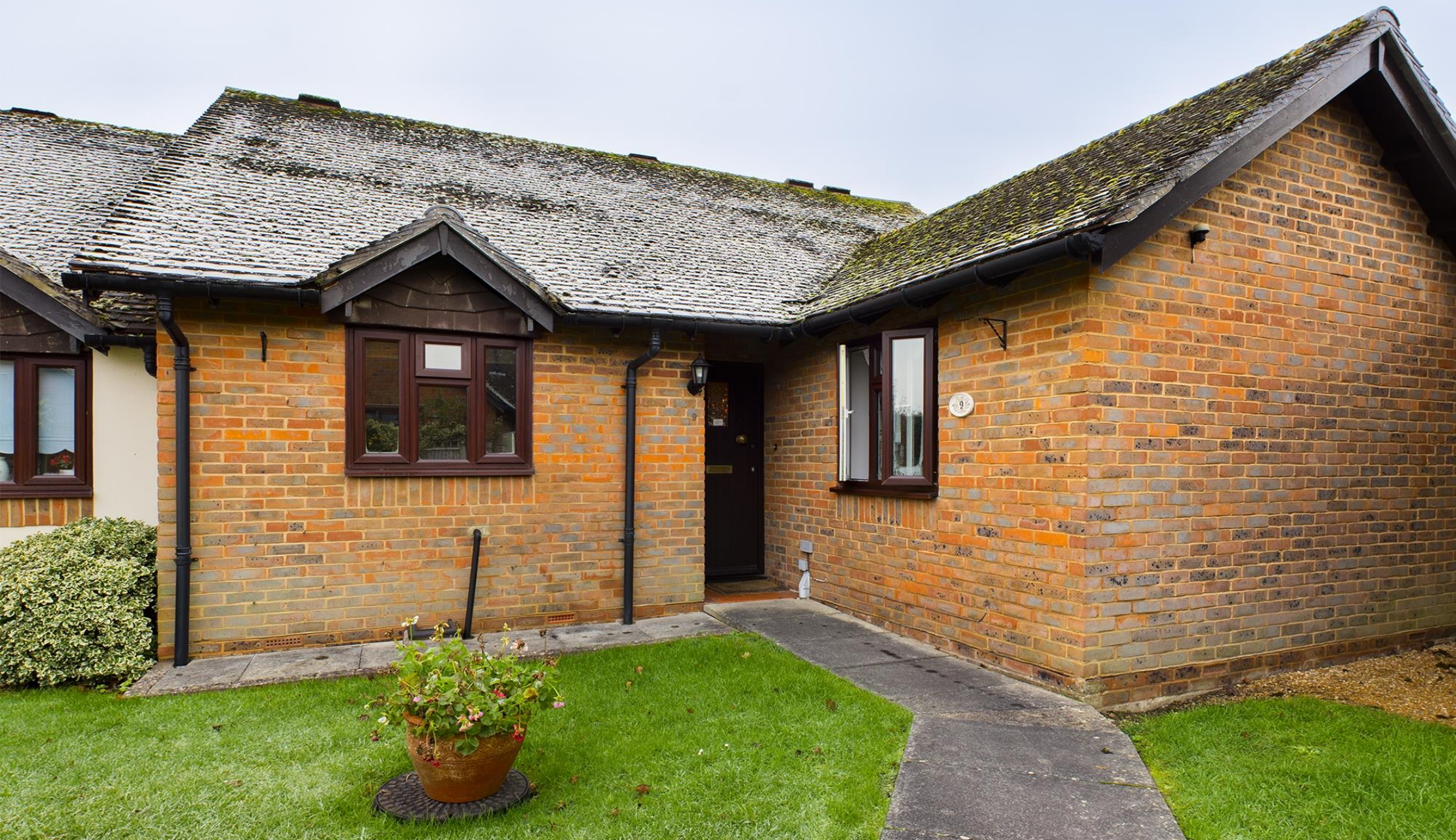
Harvest Close Lindfield, West Sussex, RH16 2