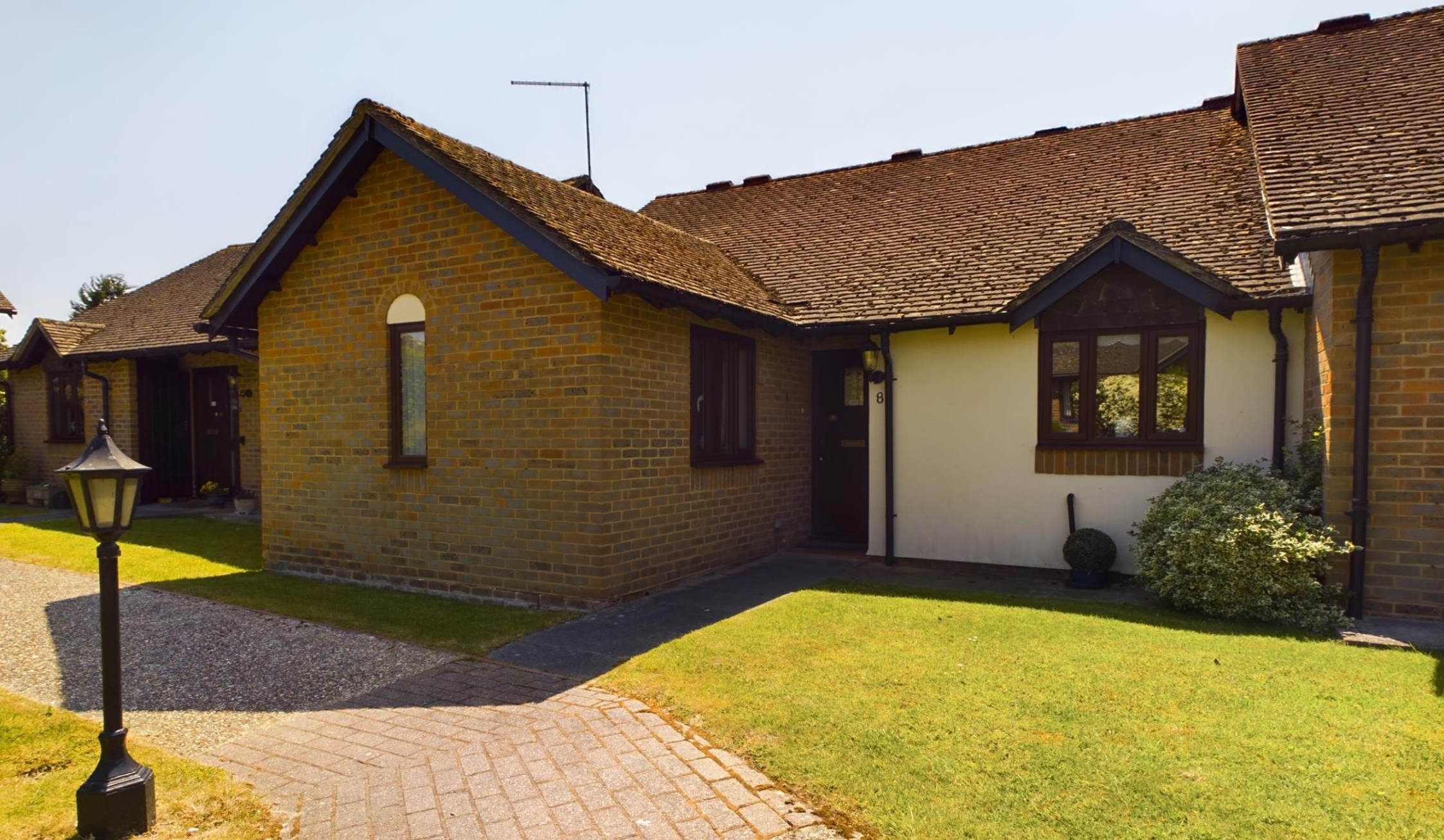
Harvest Close Lindfield, West Sussex, RH16 2