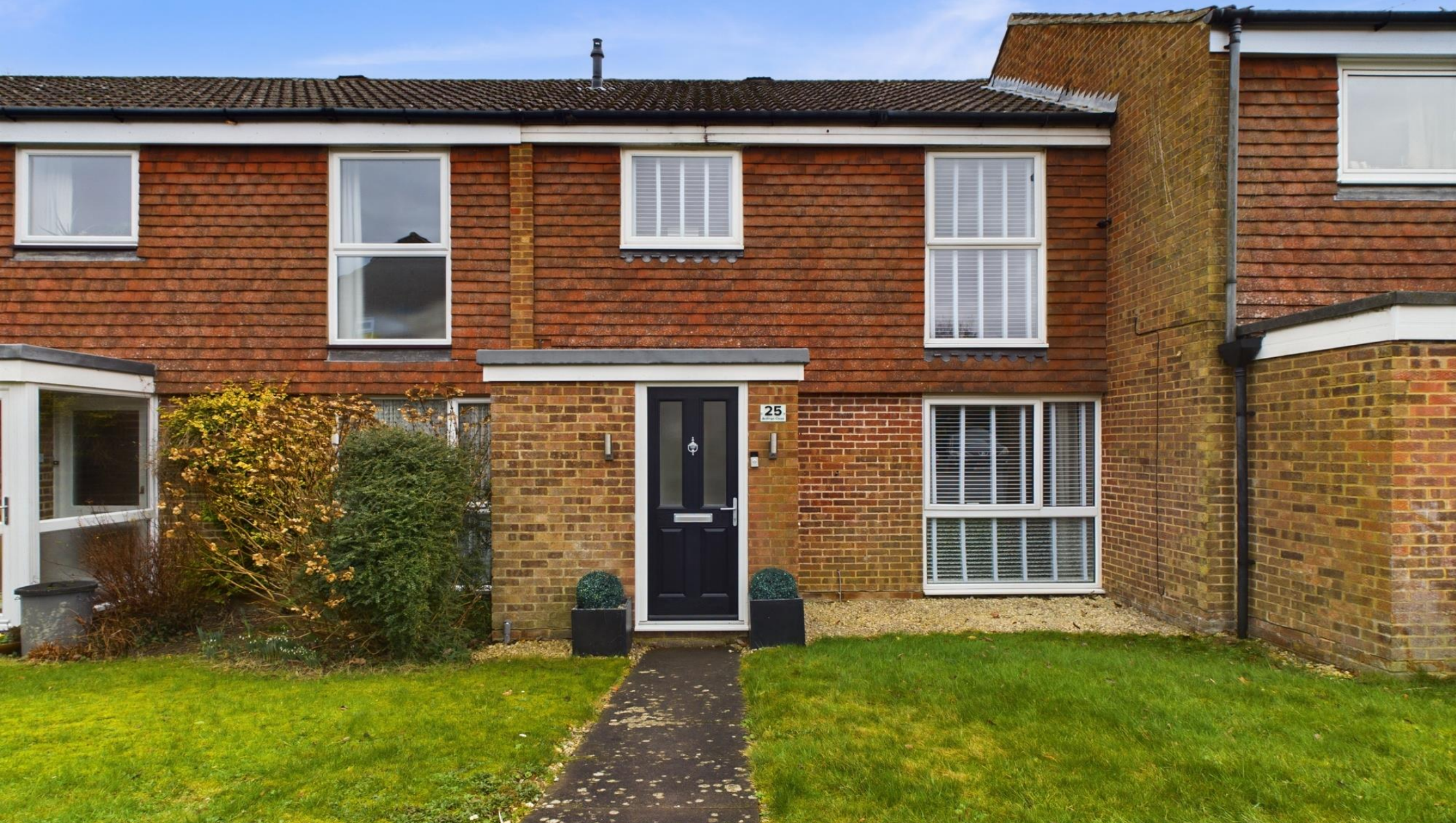
Ardings Close Ardingly, West Sussex, RH17 6