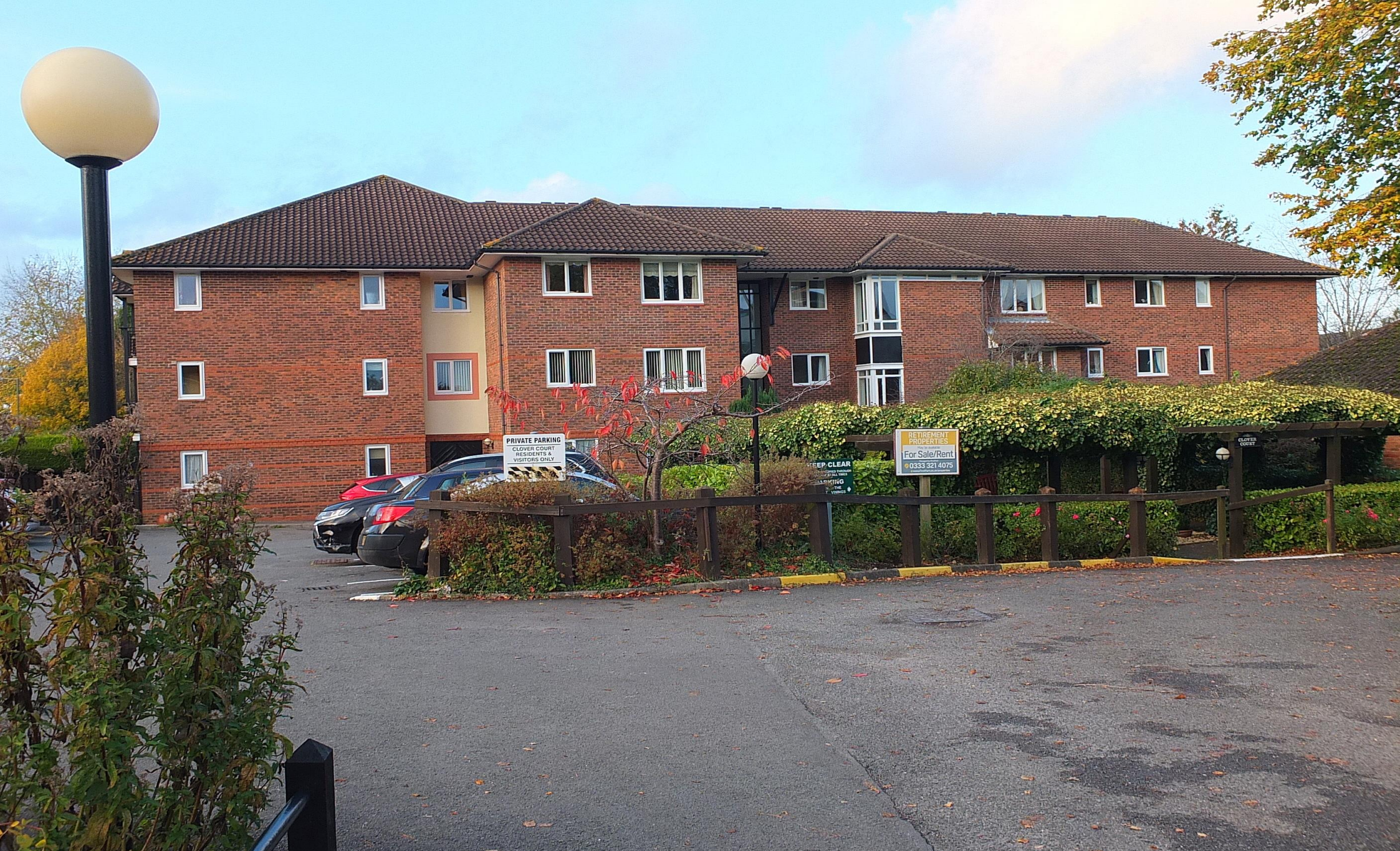
21 Clover Court Church Road, Haywards Heath, West Sussex. RH16 3UF