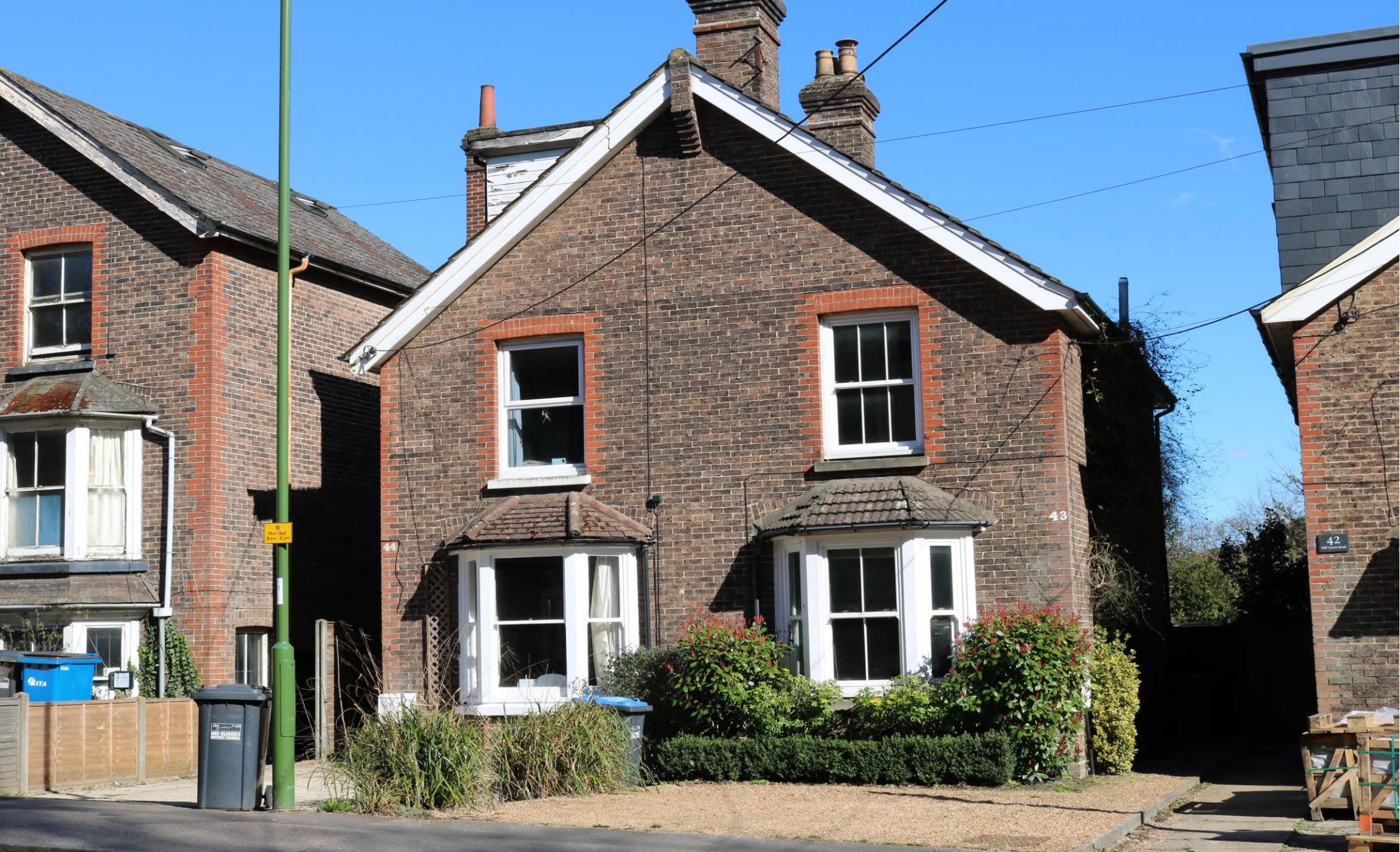
43 Mill Green Road Haywards Heath, West Sussex. RH16 1XQ