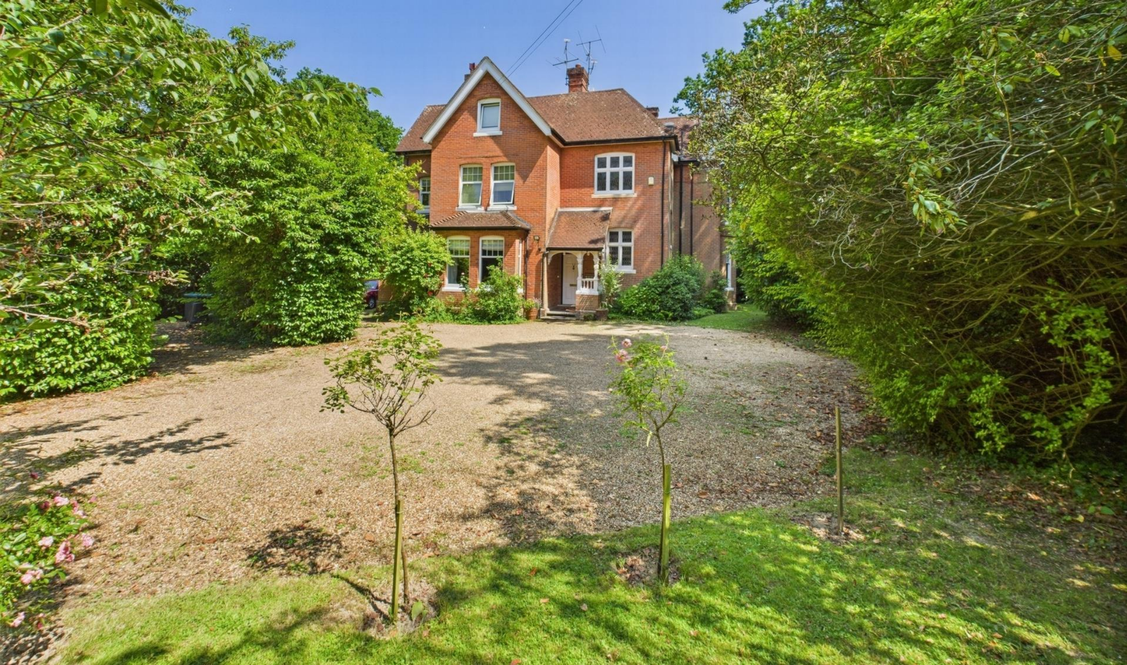
1 Corrin House 32 Oathall Road, Haywards Heath, RH16 3EQ