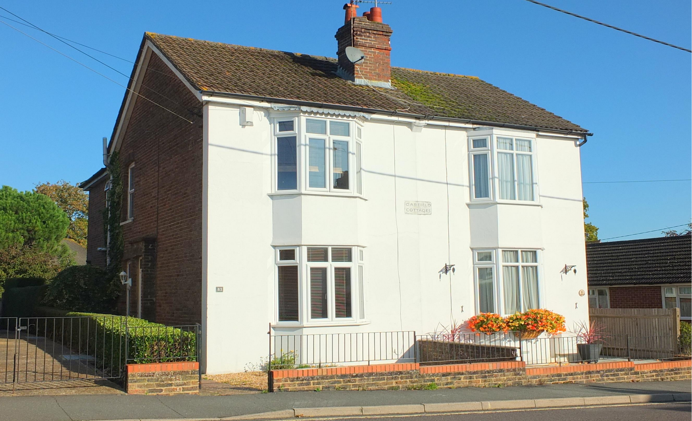
1 Garfield Cottages, 83 New England Road Haywards Heath, West Sussex. RH16 3LE