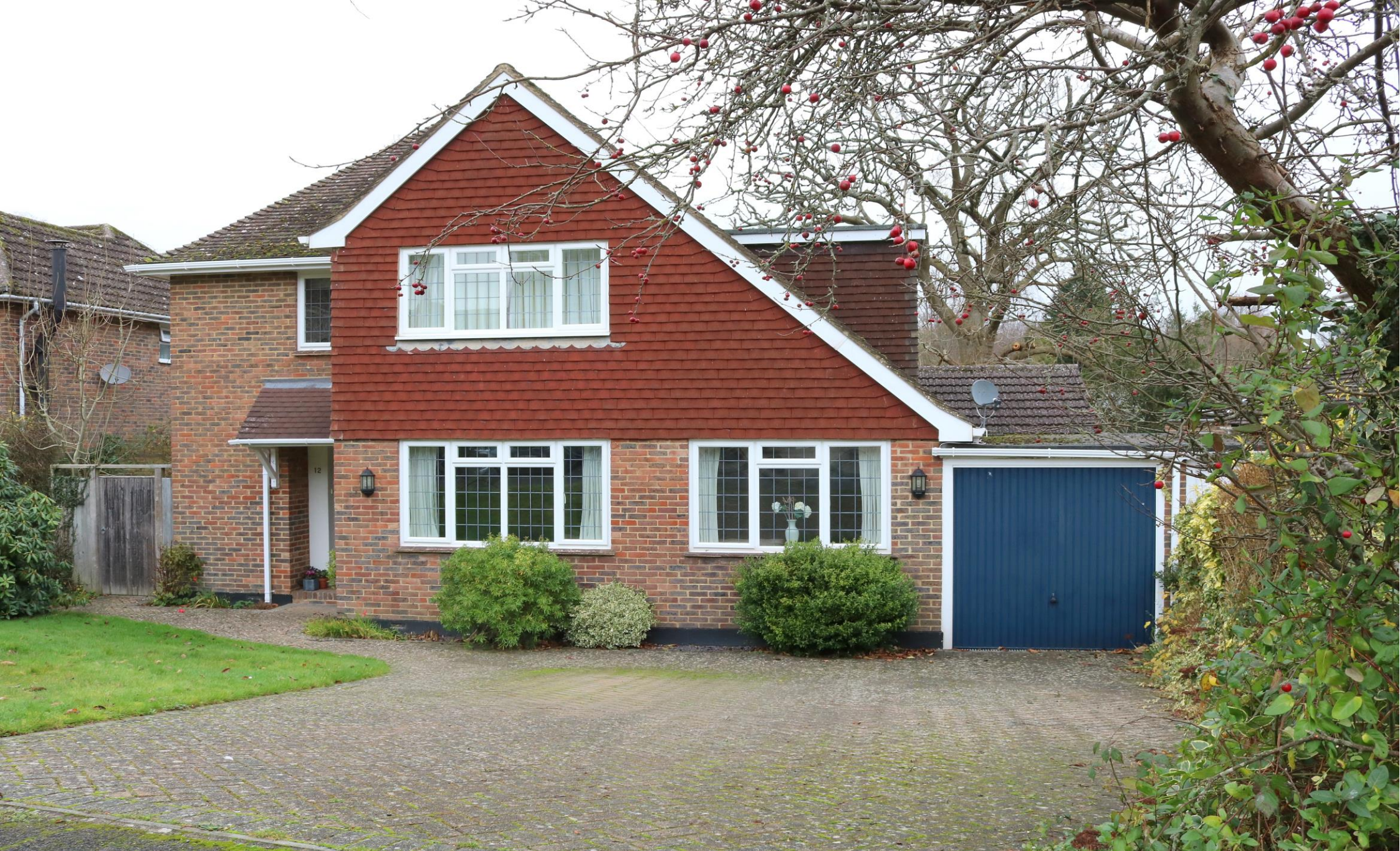
12 Gatesmead Haywards Heath, RH16 1SN