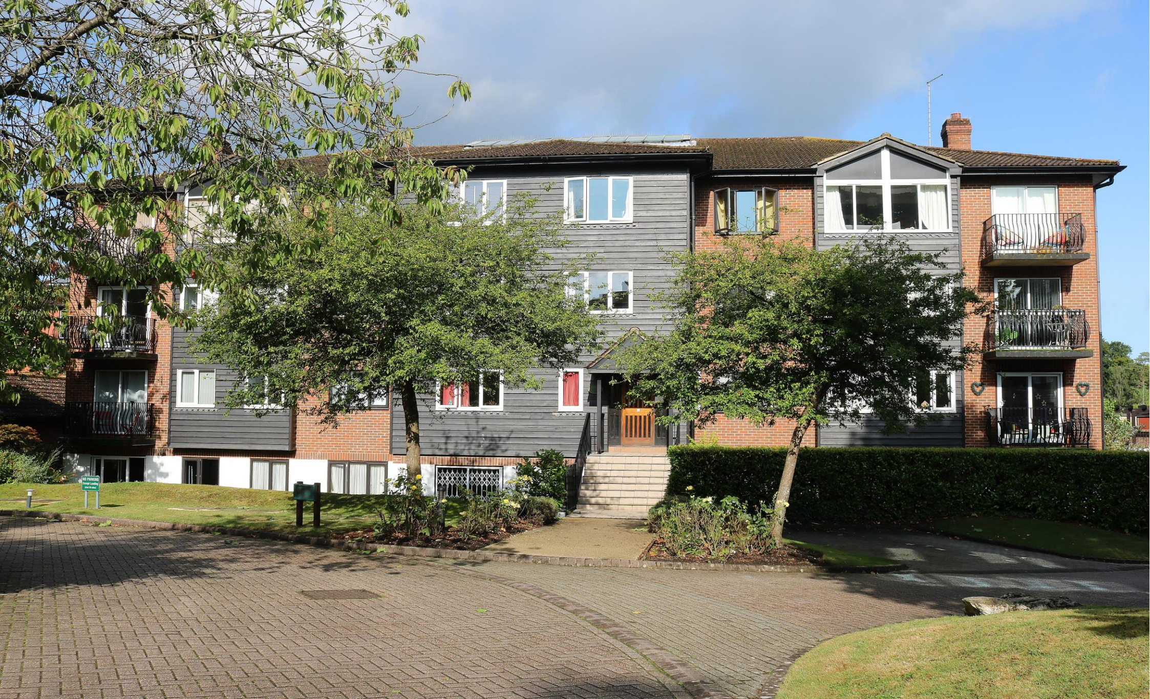
1 Laurel House Great Heathmead, Haywards Heath, West Sussex. RH16 1FE