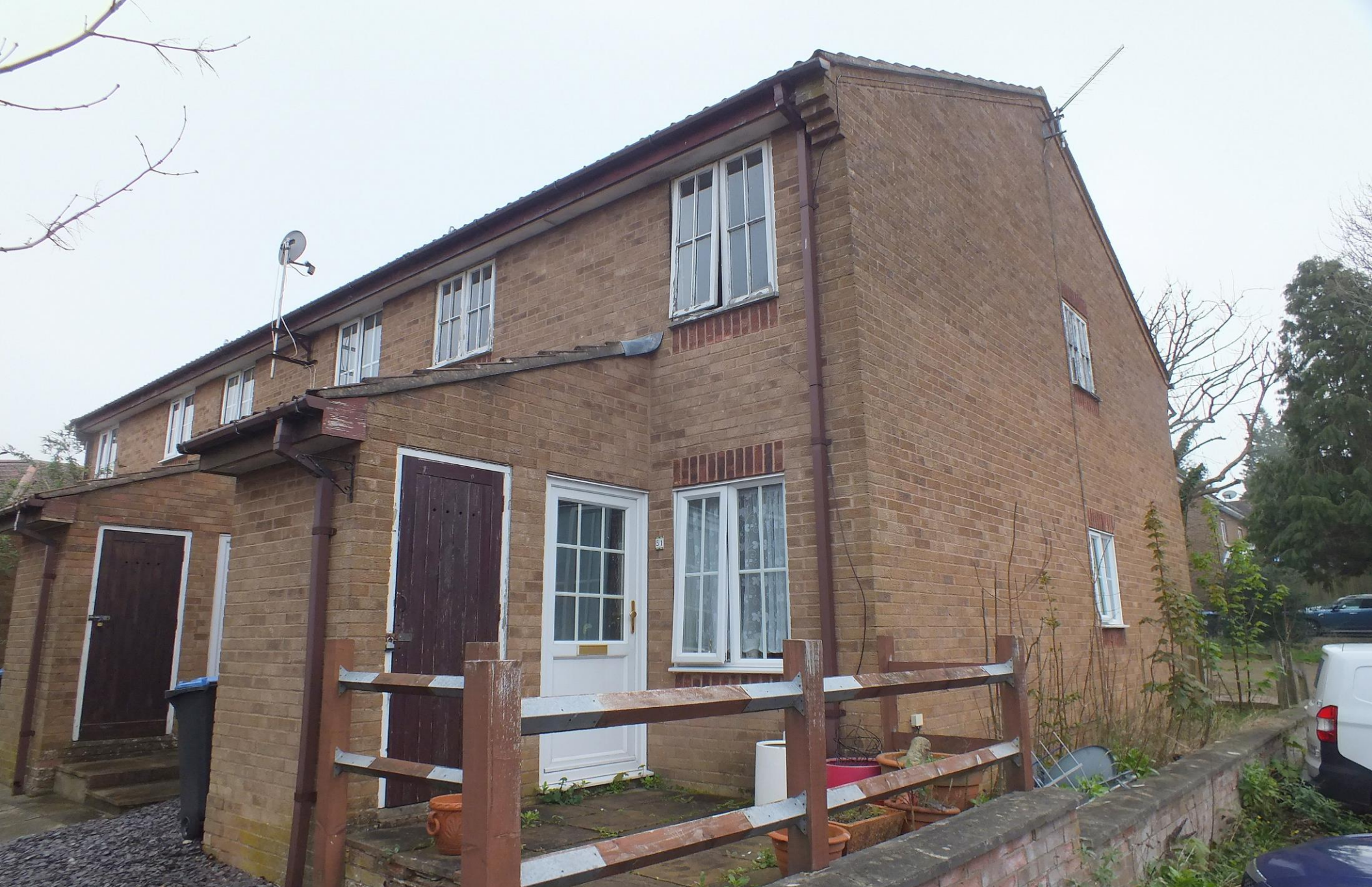
51 Colwell Gardens Haywards Heath, West Sussex. RH16 4HG