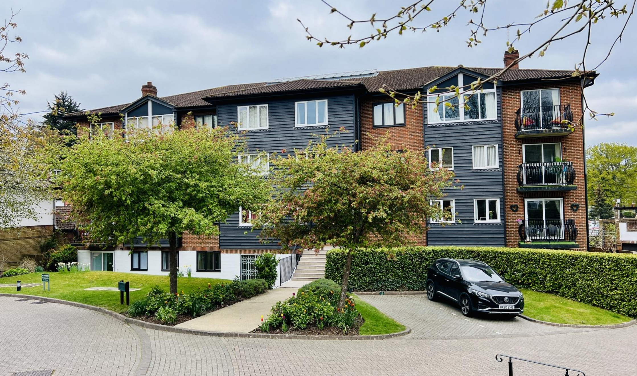
23 Laurel House Great Heathmead, Haywards Heath, RH16 1FE